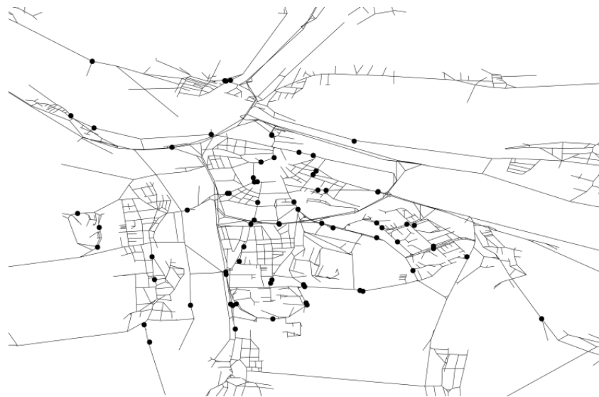
Fig. 1. Model of transportation network in region Žilina, Slovakia Bild 1. Verkehrsnetzmodel im Region Žilina, Slowakei