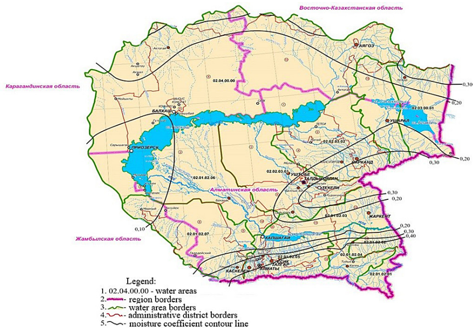
Figure 2. The Balkhash-Alakol basin

Studying the soybean productivity features associated with different irrigation methods allows determining the most optimal growing conditions for a particular variety, providing for a significant yield increase.