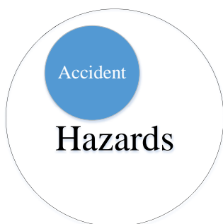
Fig. 2. Relationship of accidents and hazards

24model holds that the hazards are equivalent to the causations of the accident. From a systematic point of view, the system is a group of interconnected entities, which means that the accident is the consequence of the system migrating to the high risk status integrally. So that the failures and adverse interactions of all components in system are the causes of the accident, hazards contain human factors, physical factors, organization, organizational external factors.