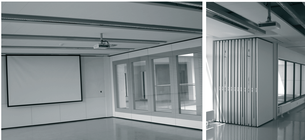
Fig. 6,7. The mobile divisions on the fourth floor - extended and retracted.