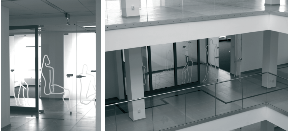
Fig. 4,5. The walls by MARS with Le Corbusier's pictograms.

The concept of glazing is a vivid reference to the theme of integration – the lack of the visible divisions – the idea of onespaciality – is favourable for both the visual integration of the place, and the integration between the workers and the students.