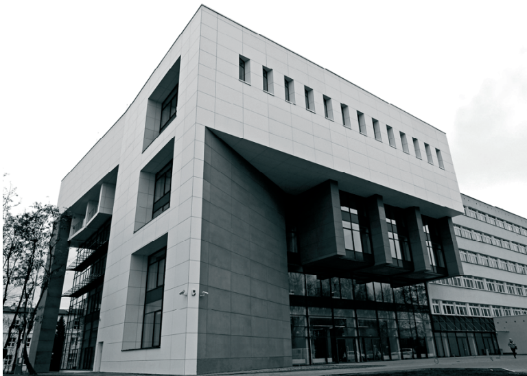
Fig. 1. Eastern Innovation Centre of Architecture – a general view.