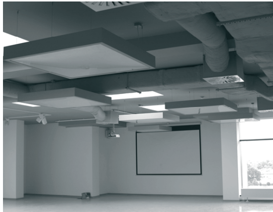
Fig. 3. A drawing room - the technical ceiling.