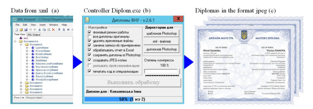
Fig. 1. Scheme of data flow from the automation controller to the automation server Adobe Photoshop

The automation controller (Fig. 1, b), using the developed methods of reading data from the xml format (Fig. 1, a), must connect to the PhotoShop interface and using its API, generate files (Fig. 1, c). In the integrated software development environment Embarcadero RAD Studio on the main form of the future controller program placed the necessary components and buttons (Fig. 1, b). When you click on the buttons "PhotoShop template", "xml-files", "PhotoShop diplomas", the appropriate directories are selected and saved in the operating system registry. Setting (unchecking) the appropriate Visible flags leads to the inclusion and use of additional server functions: background mode, report processing in Excel, saving jpeg-copies.