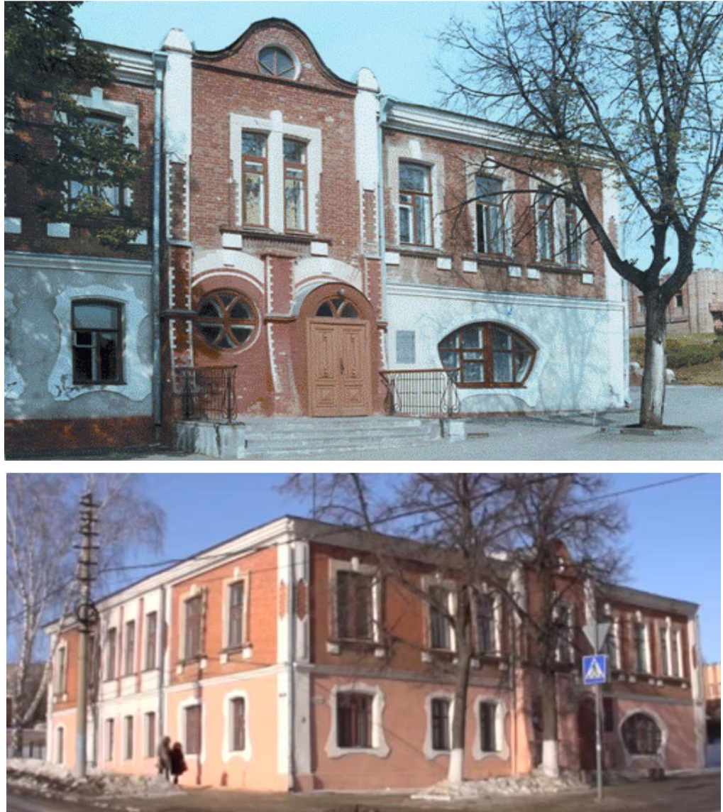
Fig. 3. Children's Music School number 1 of Penza. Source: [15]