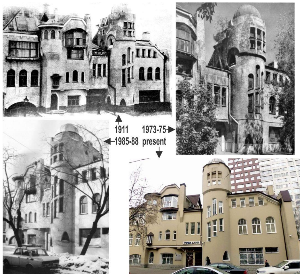
Fig. 2. Historical review of Children's Club of the Society of Settlement, architect Alexander U. Zelenko.

orations, is compared by critics with the works of Gaudi and Hundertwasser (look at fig. 1, fig.2). The Settlement combined the functions of a kindergarten for children of workers, an elementary school, and a vocational school. The license for educational activity was issued personally on "A. V. Zelenko, architect". The students of Settlement were organized in groups of 12 people (boys and girls separately). Each group independently planned the curriculum and produced its own rules of behavior, and in total, up to two hundred children studied in the building. Zelenko and Shatzky were refrained from political activities, but on May 1, 1908, the Settlement was outlawed by the police in connection with the use of children's co-management, in which they saw "the propaganda of socialist ideas" [8].