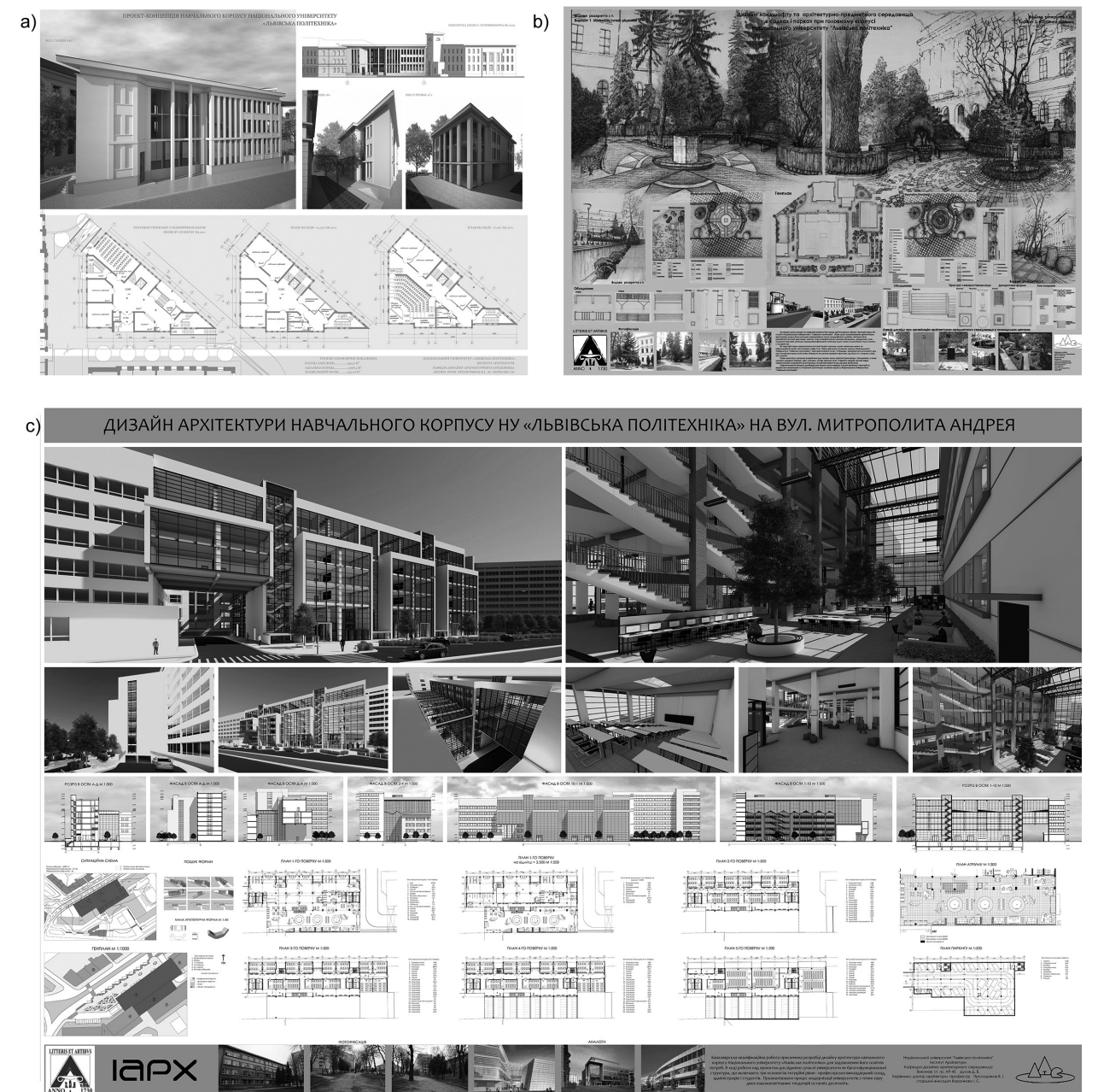
Fig. 1. a. Project-concept of an academic building of Lviv polytechnic National University. b. Landscape design architecturally-subject design of environment in gardens and parks at the main building of Lviv polytechnic National University. c. Architecture design of academic building of Lviv polytechnic National University at Mytropolyta Andreyra street

Modern times demand for a change of an old paradigm in Ukrainian national architecture – and the science about architecture in broad meaning, achieving higher level of scientific-practical generalization which from presenting certain projected-building achievements or researches dedicated to certain problems of architecture existence and specificity of activity, shift gradually to a single phenomenon in its indissoluble unity, in interaction of all constituents which form it. It all demands for wide practical and theoretical worldview of architecture creators in order not to be dissolved in one certain solution, stage, period, style and solve the problem in its evolution, from the simplest shapes of space and architecture environment to the most modern ones, treated in syncretic unity and, most importantly, in