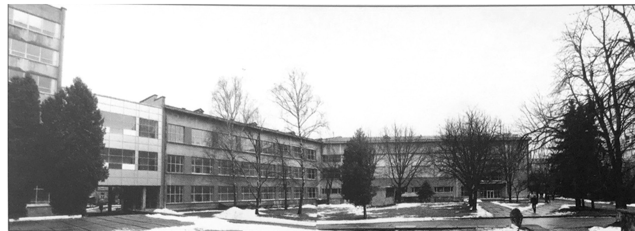
Ill. 2. Main façade of the first academic building from Konovaltsia street in Lviv

The topic of the seminar did not emerge accidentally, for a few years the department had been cultivating academic design in a way that one of the semesters is completely connected with the themes of architecturally-environmental problems of Lviv Polytechnic National University which later grew into real projects which were crowned to be built in kind. It is worth remembering arrangement around the main building or the projects of academic buildings in Ustyianovycha or Sheptytskych str (see iil. 1 a, b, c).