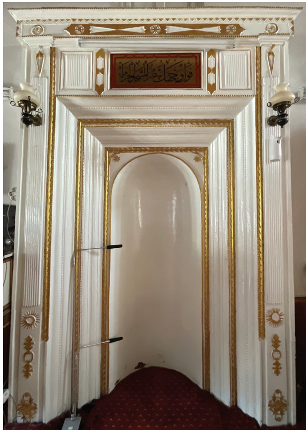
Fig. 7. The view of the mihrab of the Kenan Dede Yanık Mosque

The rain pipes and gutter system on the façade of the building, which were added later, are damaged by rup-