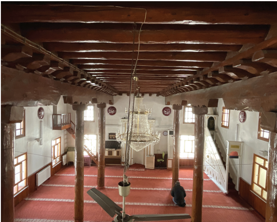
Fig. 4. The ceiling and column details of the wooden pillars of the Kenan Dede Yanık Mosque (photo by F. Bademci)

Il. 4. Widok stropu, belkowania oraz drewnianych kolumn meczetu Kenan Dede Yanık (fot. F. Bademci)