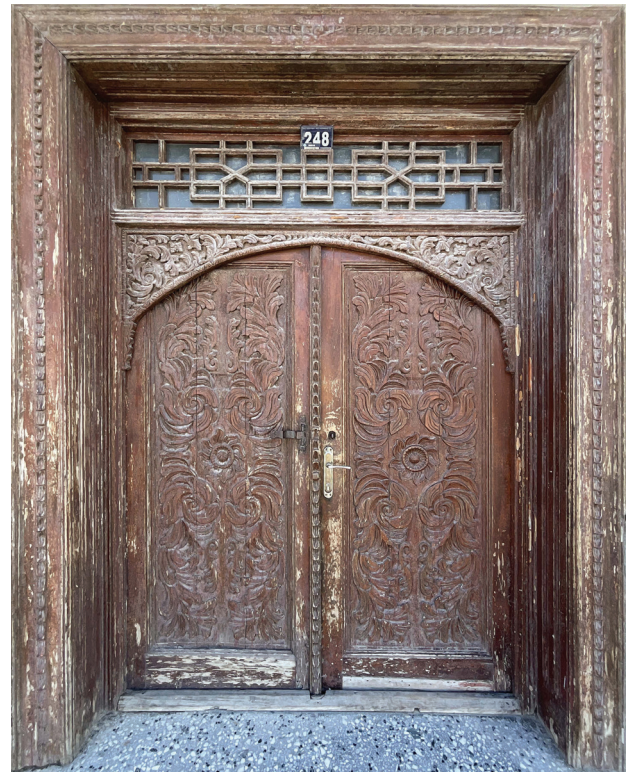
Fig. 8. The view of the door of the Kenan Dede Yanik Mosque

Kenan Dede Yanik Mosque in Konya is a 19 th century building with wooden pillars. Wood, stone, and mudbrick were used as building materials. In addition to the wooden pillars in the haram section of the building, there are rubble stones on the walls up to the plinth level and mudbricks on the rubble stones. In the building where wood is extensively used, there are a pulpit, mihrab, minaret, and doors that have historical value. The building, which has a load-bearing system, material and historical value, is