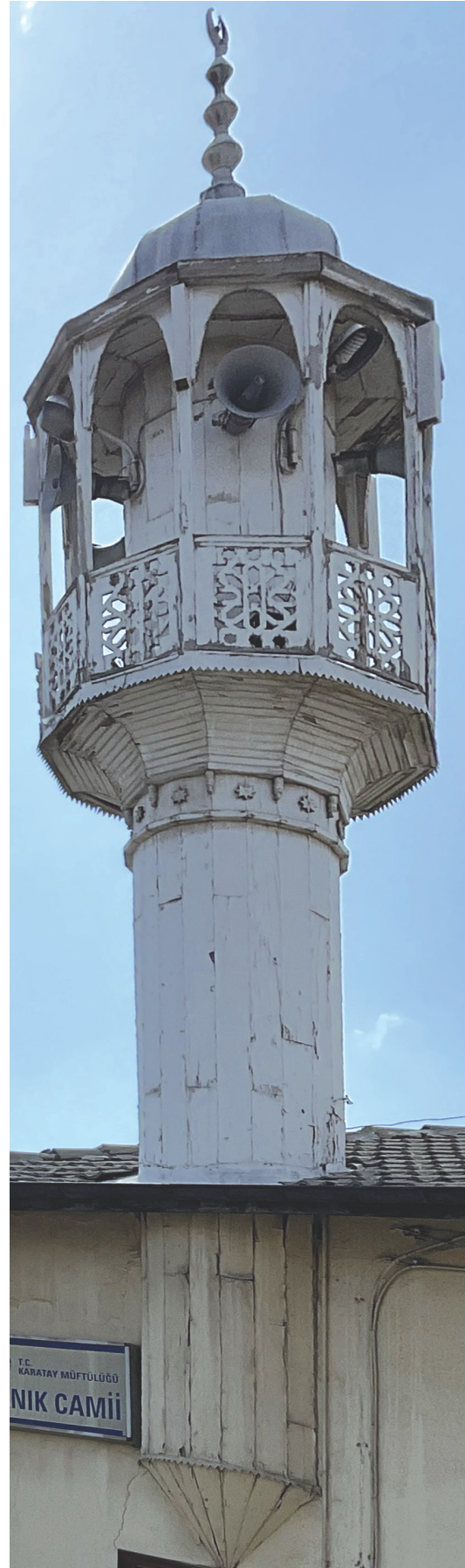
Fig. 5. The view of the minaret of the Kenan Dede Yanik Mosque Il. 5. Minaret meczetu Kenan Dede Yanik

The other load-bearing element of the building is the walls. The deterioration of the walls made of rubble stone and mudbrick materials should be detected, and the materials that have lost their load-bearing properties should be replaced with the same type of materials. On the façade of the building, there are marble coverings added to the rubble stone section and cement plaster on the mudbrick section. By conducting a restitution study for the building, the type of covering on the rubble stones in the original building should be determined, and the same type of covering or appearance of rubble stones on the façade should be ensured. However, the cement plaster on the mudbrick material damages the mudbrick due to the structure of the material. For this reason, mudbrick plaster should be used on the façade of the building, not cement plaster. In the interior of the building, the plaster should be scraped and re-plastered with mudbrick plaster. The wooden panelling that was built in the interior and is up to a certain height