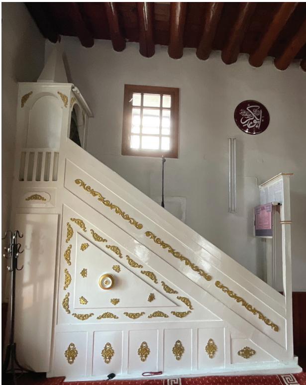
Fig. 6. The view of the pulpit of the Kenan Dede Yanık Mosque