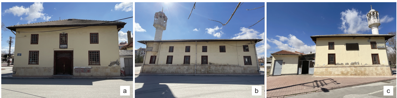
Fig. 3. The views of the outer walls of the Kenan Dede Yanik Mosque: a) northern, b) eastern, c) southern (photo by F. Bademci)

Il. 2. Widoki wnętrza meczetu Kenan Dede Yanik: a) część północna, b) część wschodnia, c) część południowa, d) część zachodnia (fot. F. Bademci)