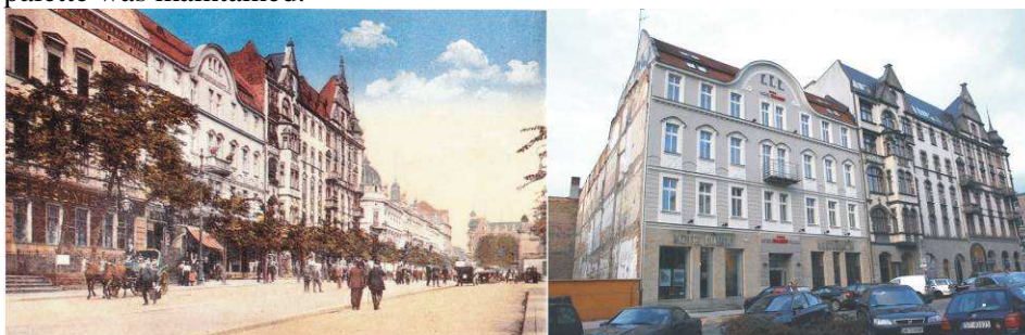
Fig. 4. Hotel Diament in Katowice next to Dworcowa Street - historic photo and state following renovation

significantly from the prototype: the stucco work was retained, a soft light color palette was maintained.