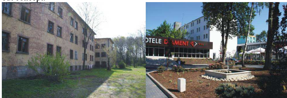
Fig. 2. Hotel Diament in Zabrze next to Cisowa street: view prior to and after modernization