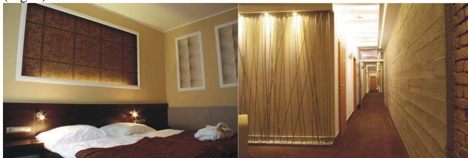
Fig. 5. Interior of hotel room following modernization (on the left), hotel corridor on the right

The modernization of the hotel which took place during the years 2011-2012 (authors Uherek-Bradecka, Tomasz Bradecki) was aimed at providing the interior with new, original esthetics, increasing the standard and adapting the hotel to a 4-star standard. Due to the fact that this involved an already existing building and the possibilities of its adaptation were somewhat limited (development in the immediate city center, stairwell and elevation subjected to historical preservation maintenance (see Fig. 5)), it was possible to meet the categorization requirements despite the fact that not all requirements set out for newly-constructed buildings were fulfilled (1,2). Original bricks (as had been done previously) were left in the corridors of the hotel as a finishing element, whereas the walls of some other parts of corridors were finished with a coating of raw concrete (Fig. 5). The hotel rooms anticipated a solution which brought about associations with the historical past: wallpapers finished with decorative profiles, the same as those used in the past to create ornamental moldings (Fig. 5).