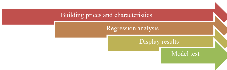
Fig. 2. Real property GIS hedonic pricing model-based valuation.

It is observed that the general implementation of hedonic model for real property value estimation will include the following steps; building variables determination, choice of regression method, and building the hedonic model. There are various specifications and alternatives being used and selected in implementing those main steps. This article summarizes and distinguishes these details. In general, four GIS based hedonic pricing modeling stages are identified, regardless of the differences among the intended frameworks (Figure 2).