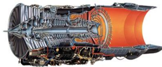
Fig. 2. Bypass engine with a low bypass ratio [28]