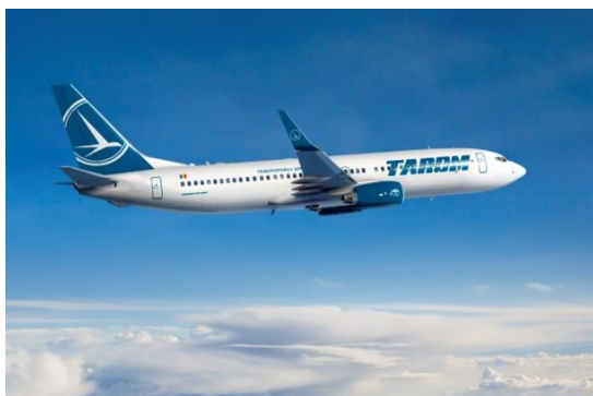
Fig. 5. Boeing B-737 with the turbofan engines [23]