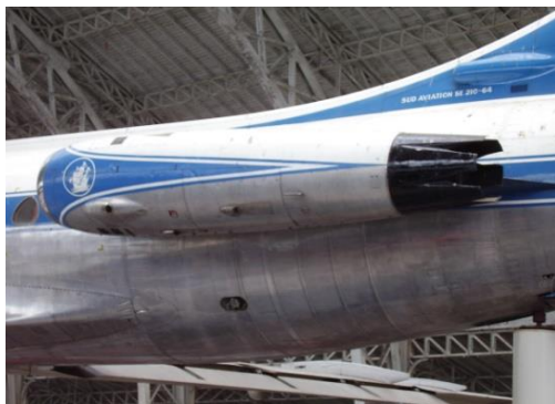
Fig. 1. External shell of a turbojet engine [27]

Regarding technical development, it is possible to say that the first aircraft jet engines were the turbojet engines, that is, jet engines without a bypass (Fig. 1). The second development step was the construction of the bypass engine with a low bypass ratio (Fig. 2). The following development introduced bypass engines with a high bypass ratio. These engines are also called the turbofan engines (Fig. 3).