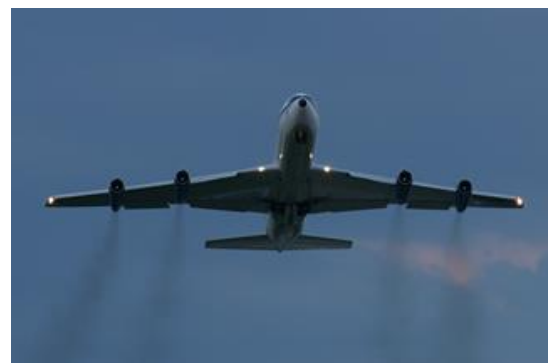
Fig. 6. Visible smoky trails [24]

For example, the specific fuel consumption of the newest versions of the worldwide popular passenger aircraft, Boeing B-737 (Fig. 5), which is driven by engines with a high bypass ratio, is approx. 4 litres of kerosene per 1 passenger and 100 km of flying distance. Such specific fuel consumption is similar to the fuel consumption of a typical passenger vehicle. The most harmful pollutants that occur in the gaseous emissions of aircraft jet engines are carbon monoxide (CO),