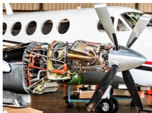
Fig. 4. View of a turbo-prop engine [30]