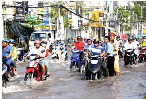
Fig. 2. Flooding due to high tide in Can Tho, Vietnam

mately 1 years GNSS data, from 2020 to 2021. Vietnam has been seen one of the most threatened countries in the world by the climate change. Mekong Delta is one of the largest deltas on the world. The height of this area is almost the sea level, then it is always threatened by the sea level rise. Under the natural and human activities, the ground in this delta is continuously compacted, causing land surface subsidence. This subsidence process in some local is faster than the sea level rise. One day, low-lying areas of Mekong Delta will be flooded by the sea level rise if effective measures are not taken [12].