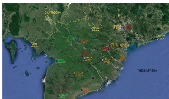
Fig. 5. Map of vertical displacement stations in the Mekong Delta, Vietnam

cm), it is necessary to study a plan to eliminate errors in the measurement data. The RMS error of displacement of all stations managed by DOSM is approximately 5 mm which can be partly influenced by the error of the remaining stations. Stations RGIA, HCMC, CTH1, CMAU, CLAH have an irregular amount of displacement possibly due to station structure.