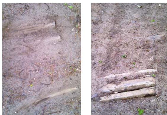
Photo 1. Pavement with shallow placed timber logs on forest road and skidder route

Roads reinforced with willow brushwood mattresses with geotextile and aggregate layers were built under constructing by the Słupsk Maritime Office in the Ustka Forest District on soils that had low bearing capacity and were very wet.