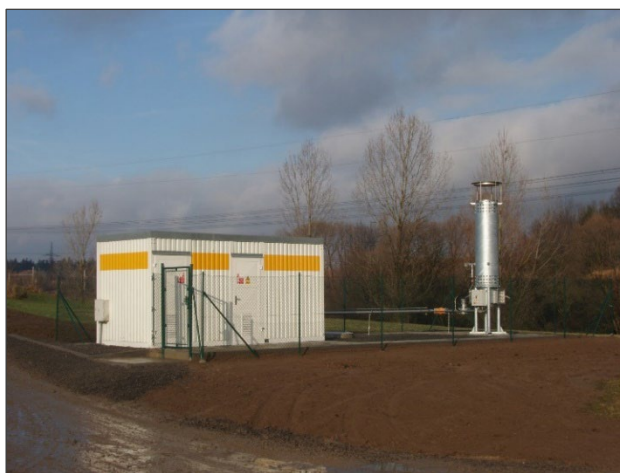
Fig. 3. Landfill gas pumping station and flare