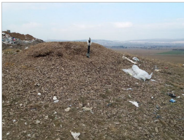
Fig. 2. Biofilter

landfill gas recovery using a cogeneration unit, these units are usually operated by an entity other than the landfill operator [20].