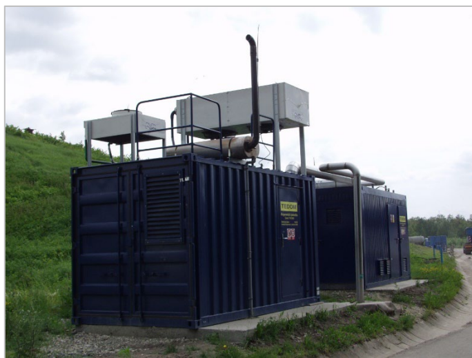
Fig. 1. Cogeneration unit

Active landfill degasification is defined by the standard as degasification under pressure. The pressure is developed in an external device such as a pumping station, which is connected to the degasification system. The active degasification system is usually terminated by a waste gas disposal facility in the form of flaring or a cogeneration unit that allows the gas to be used for energy recovery in the production of heat and power [17]. If the landfill gas is used for energy recovery, it may be treated due to its content of undesirable impurities. This mainly involves the removal of moisture, H_2S , siloxanes, and other minor components to prevent corrosion and mechanical damage to the cogeneration unit and associated equipment during the long-term combustion of landfill gas [8]. Landfill gas treatment plants are used when the quality of the gas does not meet the requirements set by the manufacturer of the installed cogeneration unit. Most often, landfill gas treatment plants consist of a condensing part to remove moisture and an activated carbon charge to remove other components [18, 19].