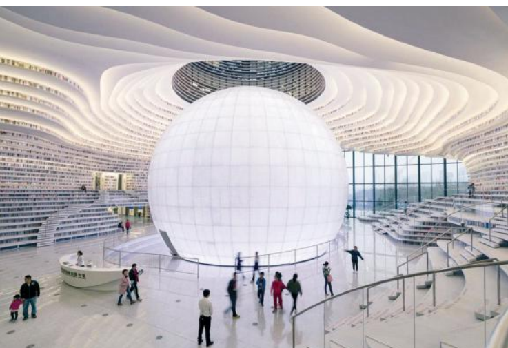
ill. 1. The Tianjin Binhai Library in China

The proposal that took the third place of honour in the competition for the design of the National Library in Prague impresses with its aesthetic form and sculptural extravagance (ill. 2b). Although the building's shape resembles a quicksilver bead after a fashion, the prototype is a cell structure that makes its nucleus the central depository, while the entire library space is engulfed in the cellular membrane of a translucent shell. 4