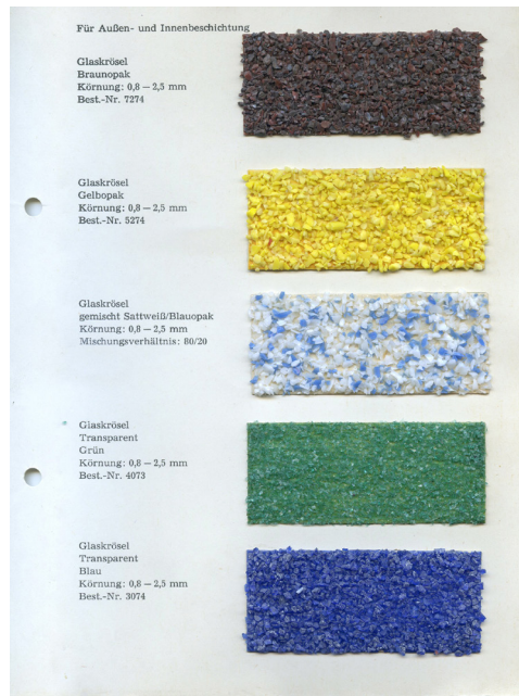
Fig. 3 Sample of multicoloured glass particles used on interior and outdoor surfaces, Manual „Electric static Design for Surfaces“ („Elektrostatische Sichtflächen Gestaltung“), around 1967.