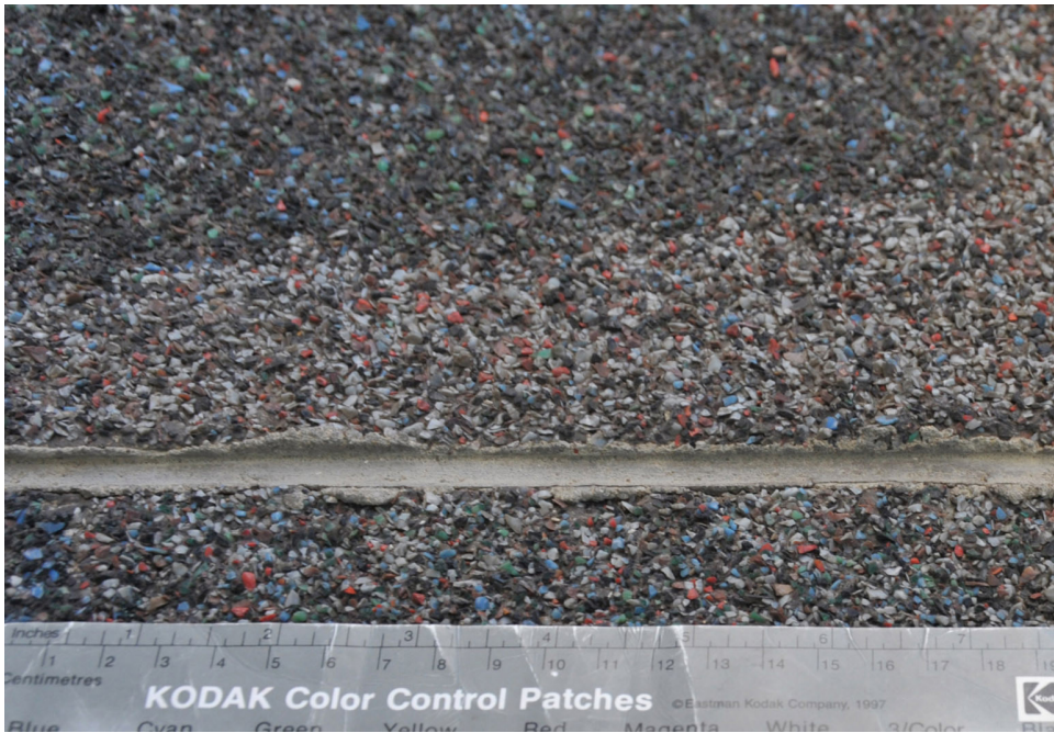
Fig. 7 Detail before and after cleaning: combination of multicolored glass particles applied electric statically.