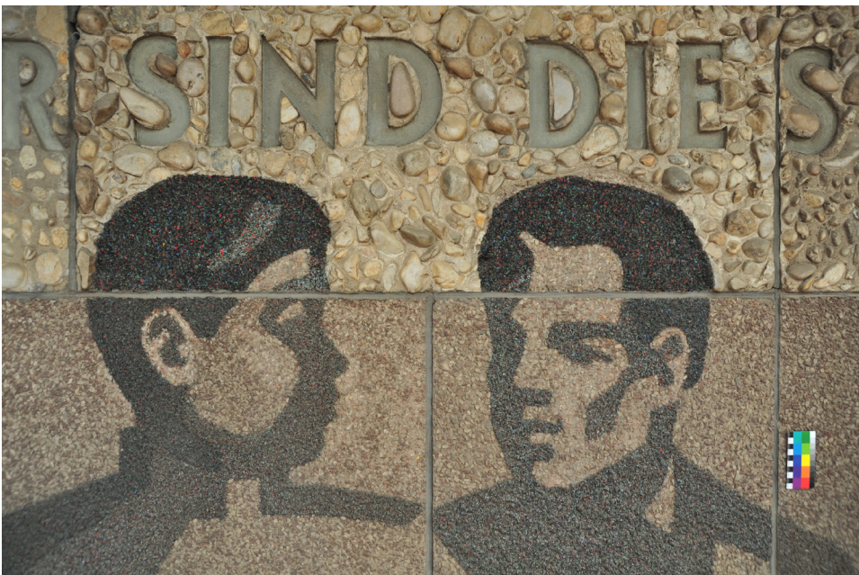
Fig. 6 Detail after cleaning: combination of multicolored glass particles applied electric statically / natural stone pebbles as exposed aggregate concrete / white and red natural stone grit spread on concrete slabs.