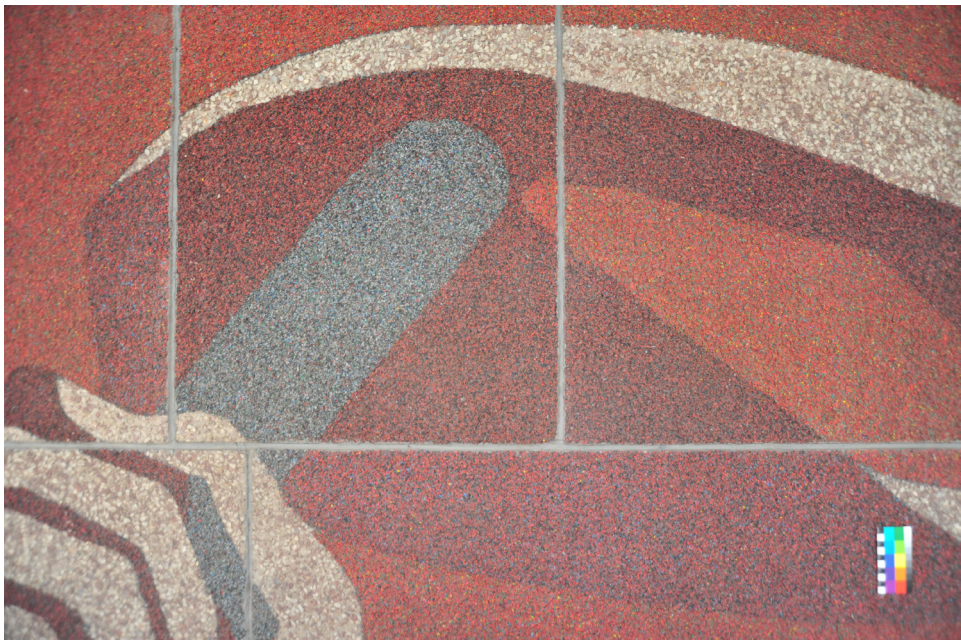
Fig. 4 Detail: combination of multicolored glass particles applied electric statically / natural stone pebbles as exposed aggregate concrete / red, blue, green and yellow glass drip as mosaic on concrete slabs.