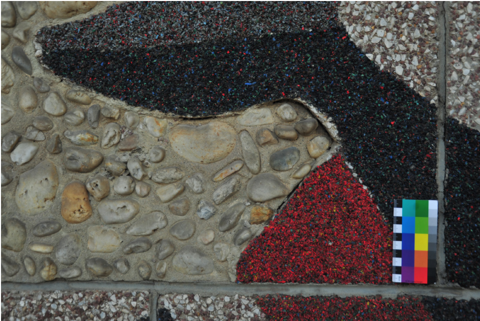
Fig. 5 Detail: combination of multicolored glass particles applied electric statically on concrete slabs. The artistic motif is ignoring the dimensions of the concrete slabs, the grey joint mortar emphasizes the mosaic like character.