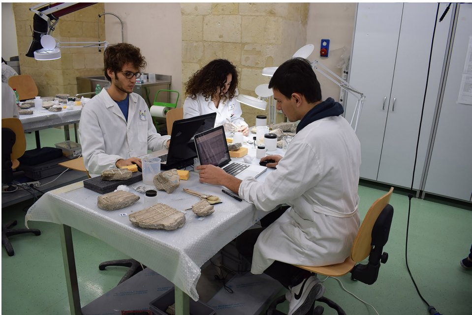
Fig.2 Data sheet elaboration

Data collection is based on UNI-NORMAL guide lines. This system works through key-words research, following a rational organization that allows an easy retrieval of information. Recording data have been elaborated with File Maker Pro, a tested software used for Cultural Heritage. This program has been chosen because of its flexibility and compatibility to all operative systems. Moreover, it allows to structure data collection in order to respond to different necessities, such as completeness and updatability, required by an efficient conservation data sheet, and the outputs are very easily storable files.