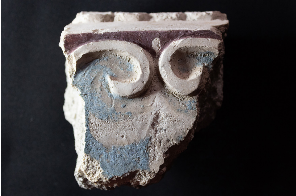
Fig.5 Oblique light points out the consistency of the painting layer

This cataloguing system makes possible to gather the recording sheet in a database that allows a faster management of metadata and an easier access to information. It represents indeed a useful instrument that can be employed by conservators and the wider academic context.