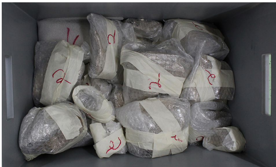
Fig. 1 Box containing stucco fragments as they come from the Archaeological Park of Herculaneum

The fragments coming from this showcase were labeled for transport in the ISCR laboratories with a number from 1 to 3; each number corresponds to the shelves of the showcase itself. It was therefore necessary to make a photographic documentation of each piece and establish a nominative criterion more appropriate to the uniqueness of the fragments. They were then placed on the tables, studied by visual observation and physically grouped according to the type and size of the decorative motifs.