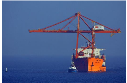
Fig. 2. Transporting an STS crane

Most of these devices is transported to their destination by sea, with the use of special vessels (Fig. 2).