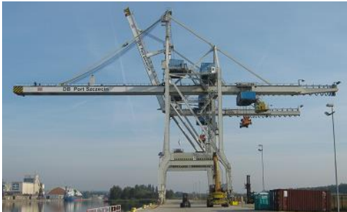
Fig. 1. STS Crane

With the dimensions of the largest presently operated container ships, it is possible to place 24 containers in a row widthwise. This means that the length of the crane's jig above the water side intended for handling such vessels should be more than 60 m. The second important parameter that affects its dimensions is the lifting height that allows to handle the highest located containers within the vessel's hull. For instance, the state-of-the-art STS cranes used at the DCT Gdańsk terminal are about 90 m high, 130 m with the jig raised – 130 m.