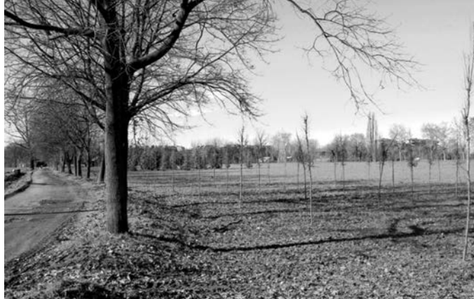
il. 2. Préverdissement in Segrate (ediesse.net)

capable to mix this concept. We start as Romolo with a cut in the ground, dividing areas, after we begin to sum elements and forms, and only at the end trees and shrubs arrives.