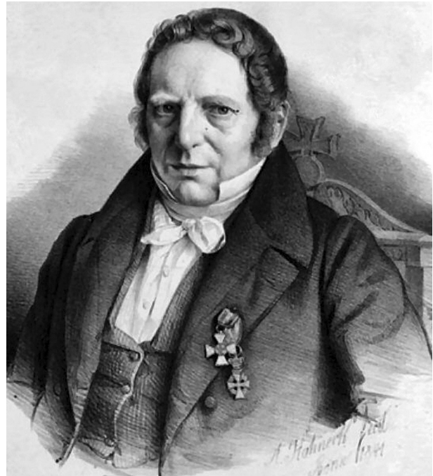
Fig. 3. Georg August Goldfuss (1782–1848). Professor of Zoology and Mineralogy at the University of Bonn