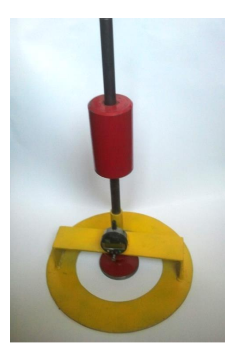
Fig. 1. Device for measuring of the changes in consistency properties on the surface of the formed concrete

The environmental temperature in a moment of concrete-mix composition was equal to 19°C, floor thickness was equal to 14 \pm 2 cm. For making samples there was used concrete mix with aggregate size less than 16 mm made on the basis of cement CEM III/A 32,5 LH/HSR, concrete category C20/25 exposure category XC3. Examination with the use of a device (Fig. 1) was made three times in three measuring points of a given floor for each 9 m<sup>2</sup> of the surface examined. In each place a reading of the measuring wheel sinking was made, the results of the measurements were averaged.