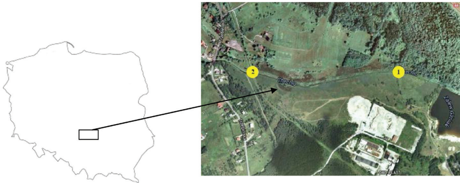
Figure 1. Location of the analysed segments of the Chechło River

The study was conducted at two sites in the Chechło River near the village of Piła Kościelecka (Trzebinia Commune, Małopolska Voivodeship) in September 2013. The first site was located at km 18+520, near a small footbridge in the vicinity of the Gliniak reservoir. The other site was situated near a former railway bridge at km 17+510.