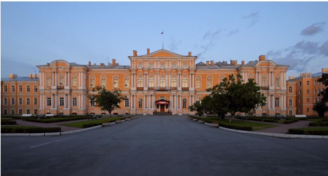
Fig. 6. Vorontsov Palace, St. Petersburg, Russia. Architects: Bartolomeo Francesco Rastrelli.