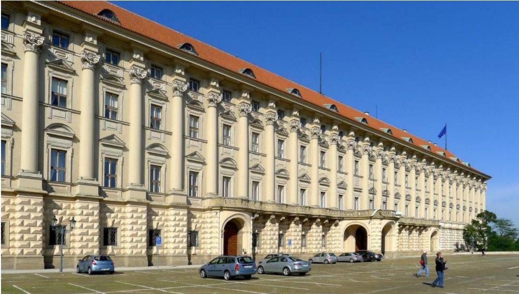
Fig. 5. Czernin Palace, Prague, Czechoslovakia. Architects: Francesco Caratti.