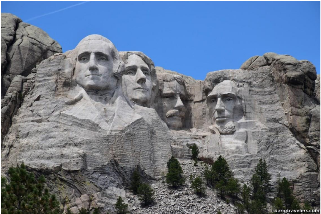
Fig. 8. Mount Rushmore National Memorial.