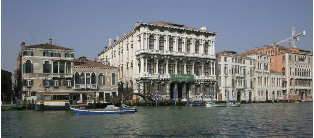
Fig. 7. Ca' Rezzonico, Venice, Italy. Architects: Baldassare Longhena.