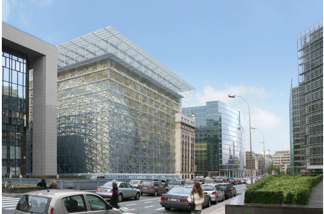
Fig. 4. Residence palace, Brussels. Architects: Samyn & Partners, Studio Valle Progettazioni and Buro Happold.