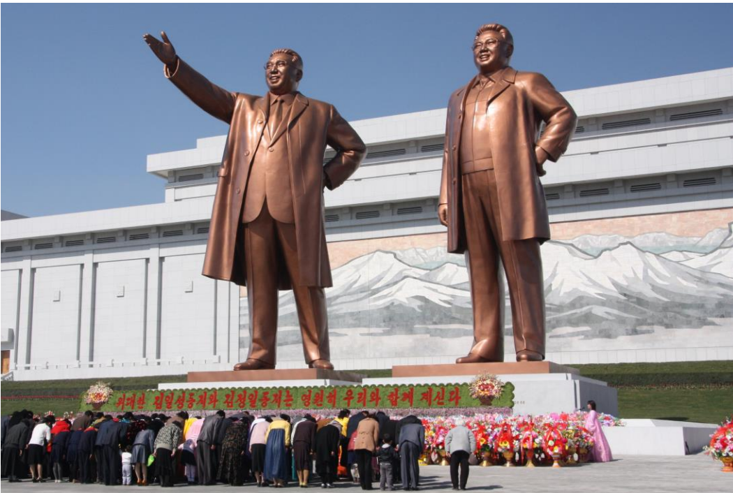
Fig. 3. Monument to Kim Il Sung and Kim Jong Il.