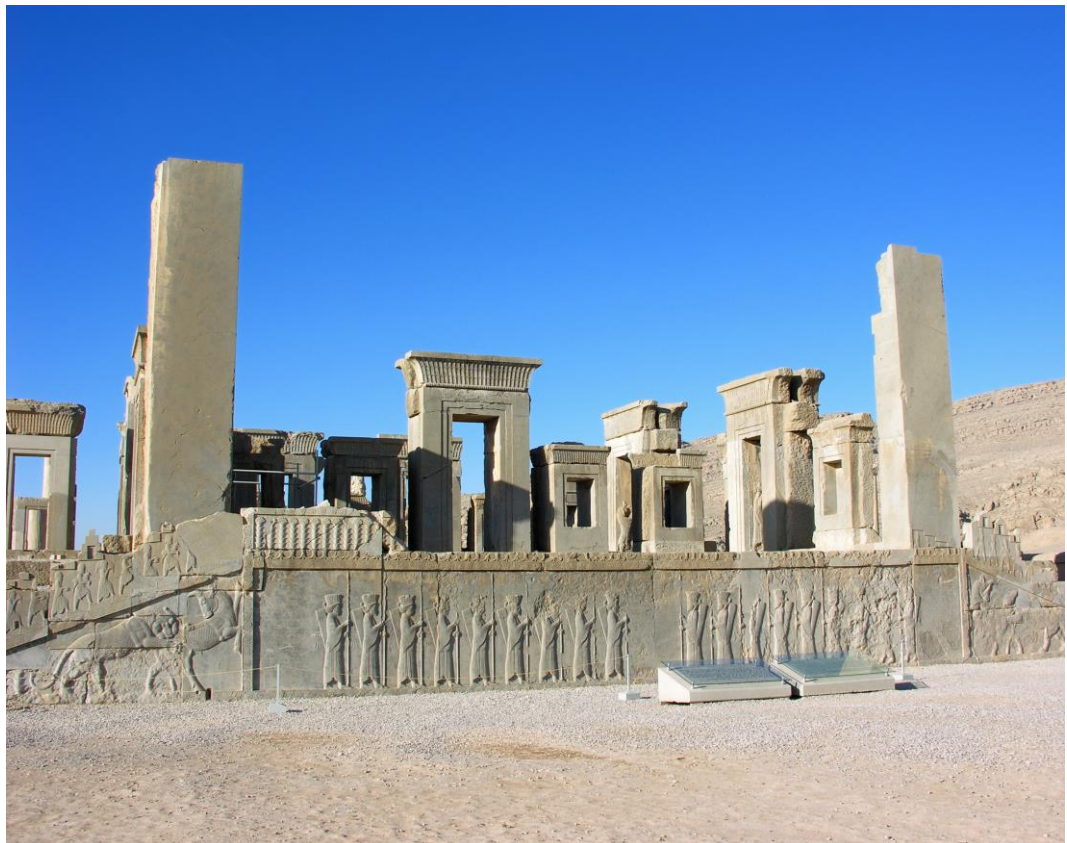
Fig. 1. Apadana, Persepolis.