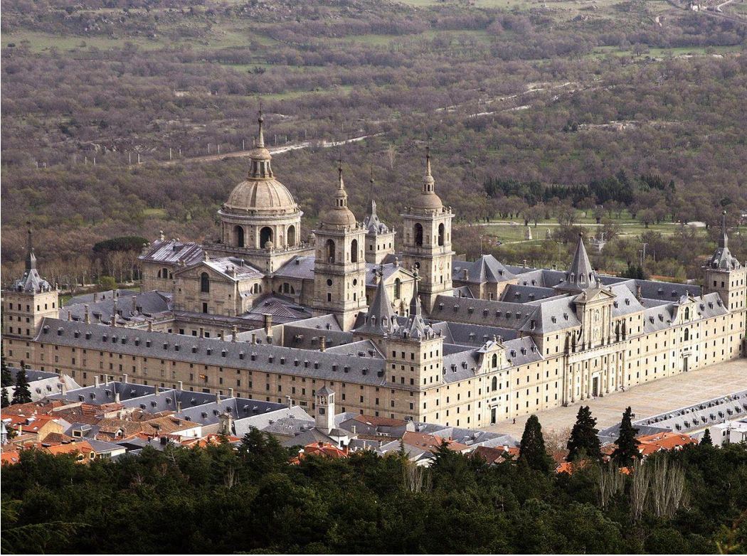
Fig. 2. Monastery of San Lorenzo de El Escorial. Architects: Juan de Herrera.