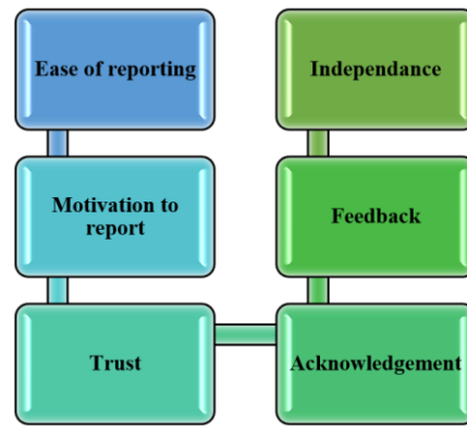
Figure 4. Pre-requisites of a Just Culture. Adapted from Eurocontrol [7].

In aviation, Just Culture is not new and has been embedded, both implicitly and explicitly, within aviation legislation for many years. It has been successfully implemented in the aviation industry to improve the level of safety aspects of organizations. A Just Culture is one aspect of a safety culture and the prerequisites to achieve a Just Culture include independence, feedback, acknowledgment, ease of reporting, motivation to report, and trust [7] (Figure 4).