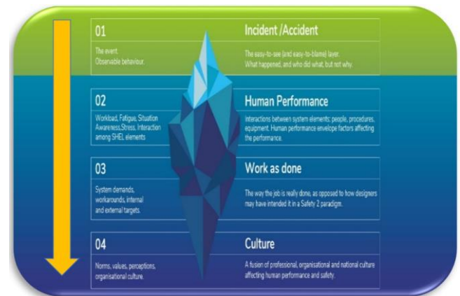
Figure 2. Human Factors Iceberg-SAFEMODE project.

such as location, date, injuries, type of vehicle, involved actors, and contextual conditions. 2) Occurrence assessment, describing the classification of the severity and the types of human factors that contributed to the occurrence. 3) Safety positive actions and learning, describing actions of human operators and/or technical systems that prevented occurrences getting worse (accident prevention) or that limited the consequences of an accident (consequences mitigation), and describing lessons learned following a safety occurrence, e.g. changes in system design, training or procedures.