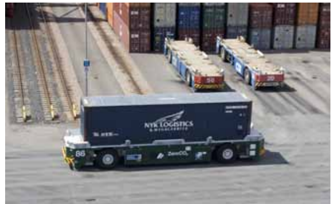
Fig. 3. AGV in the HHLA Container Terminal Altenwerder, Hamburg/ Germany (CTA).

Today, the AGV development process is directed towards capacity and flexibility development or increasing the functional scope (ALV). The concept of C-AGV offers a load capacity of 61 tonnes. A vehicle can carry cassettes with double-stacked 40-foot containers or two 20-foot containers in a single tier. Major improvements to manoeuvrability have been made by incorporating individual electrically-driven and steered bogie axles which enable the C-AGVs to be moved in any direction and turn 360 degrees [31]. An Automated Lifting Vehicle (ALV) is another way of AGV development. The vehicle mostly engaged in transport services (horizontal movement) is also fitted with the possibility of lifting a container up from the yard. So far, this kind of equipment is still in its infancy stage.