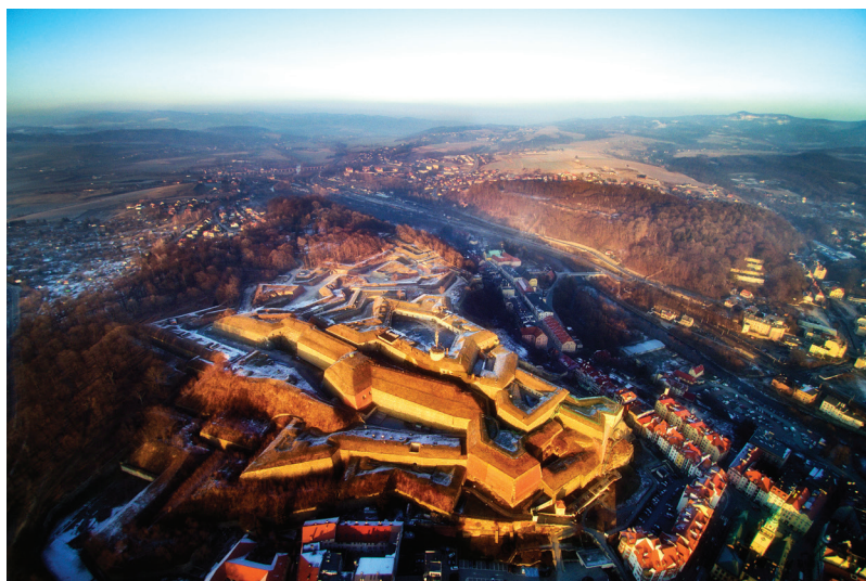
Fig. 5 A bird's eye view from the west on the complex of Kłodzko fortifications. In the foreground the Main Fortress, in the background the Fort Owcza Góra