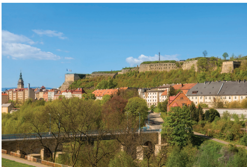
Fig. 4 The view on the Main Fortress and the former Ząbkowice Suburb with barracks and granaries. In the foreground there is a former bridge over the Nysa Kłodzka River