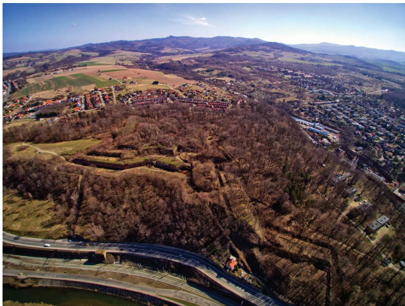
Fig. 3 View from the bird's eye view from the west on Fort Owcza Góra