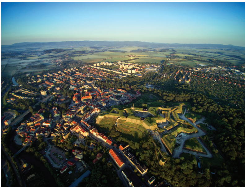
Fig. 2The Shadow Fortress from the bird's eye view West - East orientation