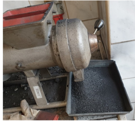
Fig. 2 Laboratory crusher

The obtained coal sample of 0.5 kg was then crushed in a laboratory crusher (Fig. 2), to obtain grains below 2 mm size.