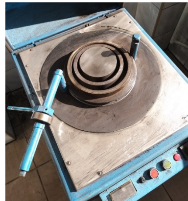
Fig. 3 Cylindrical – roller mill

A preparation of the representative sample of ash consisted in crushing separated lumps of coal in a laboratory crusher, then milling it in a ring mill (Fig. 3). A preparation of the fine granulation material results from the standards for a sample combustion, to obtain hard coal ashes.