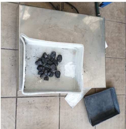
Fig. 1 Selected sample

A preparation of coal for testing consisted in selecting the representative sample of 0.5 kg from the 50 kg seam sample (Fig. 1), using a sample divider (in the case of coal lumps larger than the gap of the divider it was necessary to crush them first).