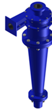
Fig. 5 Model of hydrocyclone

A hydrocyclone (Fig. 5) is a high-performance device that uses the centrifugal force in a liquid medium to separate the mixture into two components effectively.