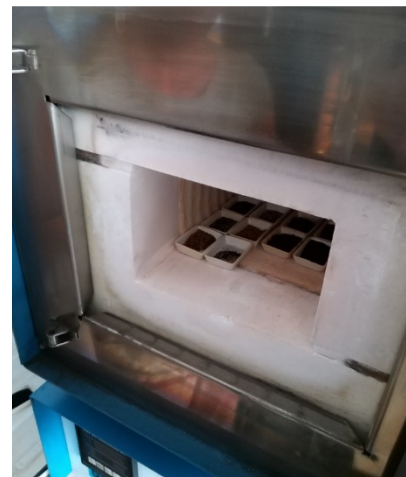
Fig. 4 Laboratory furnace PM-6/1100A

Then 10 crucibles were prepared and filled with 2 g of finely ground coal in each one, weighted on a laboratory scale. They were placed in the PM-6/1100A (Fig. 4) laboratory chamber furnace to obtain about 1-2 g of ash after burning. The coal was burnt in the laboratory furnace, according to the Standard PN-ISO 1171:2002 [26].