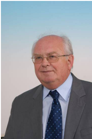
Fig. 1. Prof. Wojciech Pachelski

Received: 14 April 2020 / Accepted: 7 May 2020