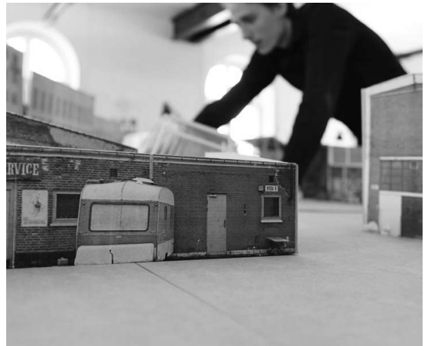
Fig. 2. Scenographic sets, photo: by authors