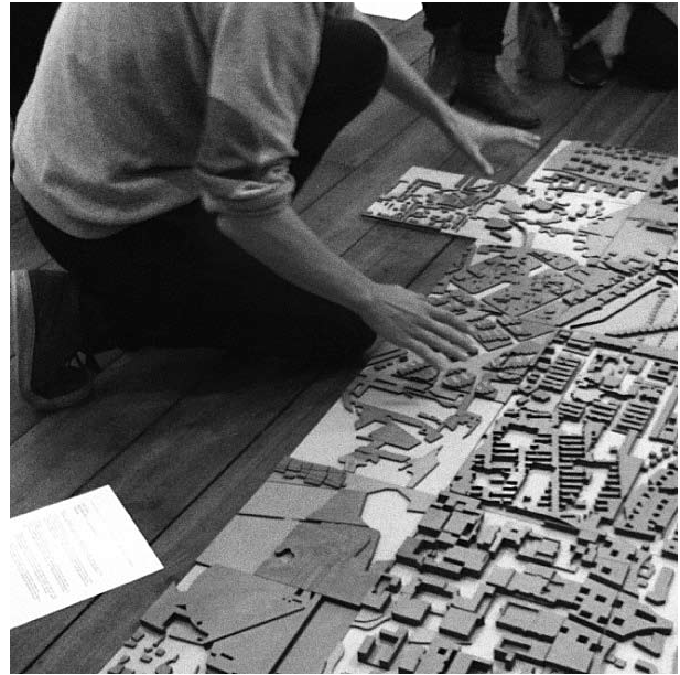
Fig. 1. Conventional structure model

seem more appropriate to approach in a bigger scale. The conventional and detailed large-scale model or scenographic sets - in e.g. 1:25 in card or wood - can provide us with good possibilities of examining architectural and sensual experience of the project. It can be made fast and altered spontaneously and is present as physical and haptic object to be touched and discussed in this world. 5