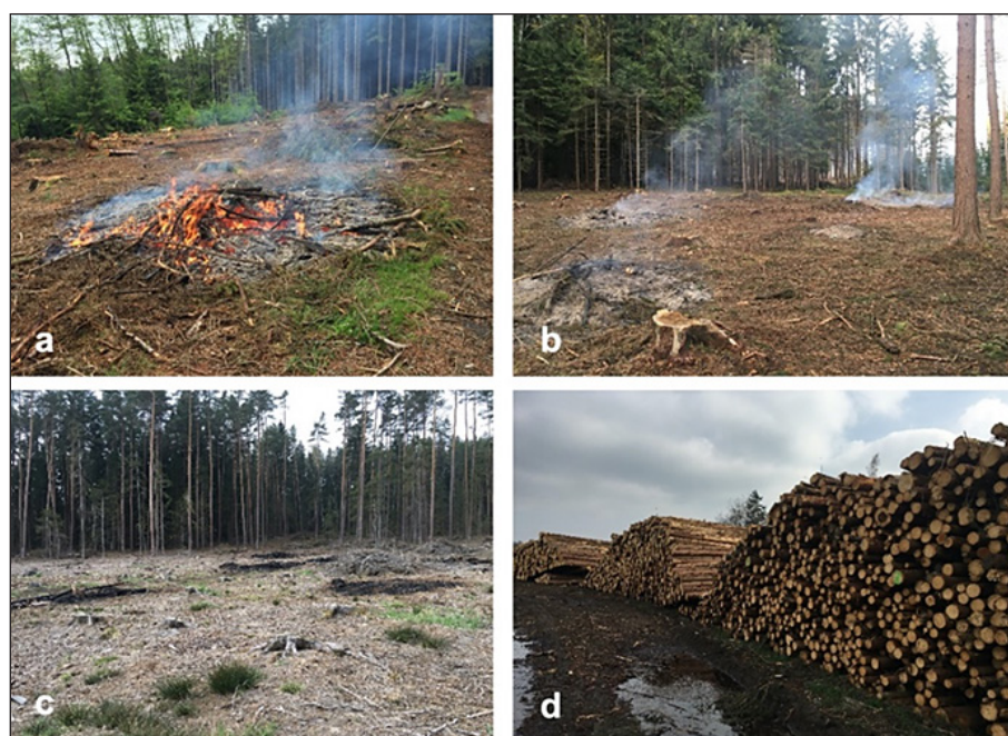
Figure 1. a) piling fire; b) burnt away fires; c) burnt points; d) felled logs infested by bark beetle calamity

The soil is a typical acidic cambisol, formerly called brown forest soil, and \text{pH}_{\text{KCl}} 3.4 was measured in the subjected locality. The low pH can be assigned to strong fall of coniferous litter (needles) (Goldblum et al., 2009) and to atmospheric acidic deposition (Yang et al., 2015). The locality had suffered from a bark beetle calamity and the most hit part had to be cut down (an area of approximately 100×100 m). The large trunks were cleared from branches and removed from the area. The left branches and brushwood were locally burnt on several places (Figure 1). The burning took place on 23 rd May 2020 and the fire was maintained for several days. These fires can be considered as a moderate to high intensity fires, because the surface of the soil remained covered