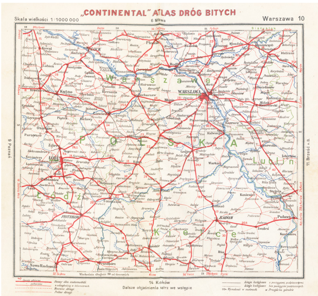
Fig. 2. A map sheet of the atlas, Warsaw 10 (reduced)

Distances in kilometers, nowadays referred to as mileage, have been given only between