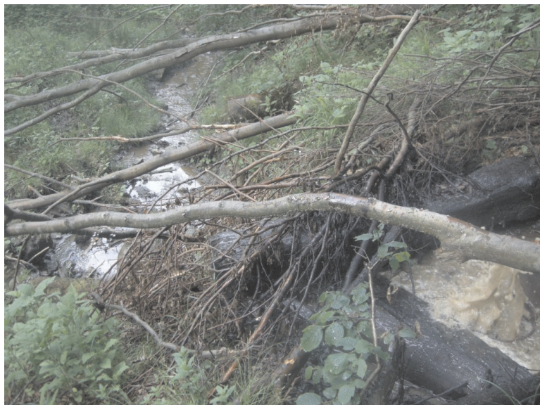
Fig. 6. Water surface water pollution by oil spills

Apart from accidental outflow of oil-polluted water the hydrocarbon leakages have been seen in the abandonment mining area. Methane which is released into the air could be a source of explosive blowing. The methane emission could cause fire hazard. Even if its release into the air does not cause any accident it is responsible for the greenhouse effect and the resulting negative environmental impact.