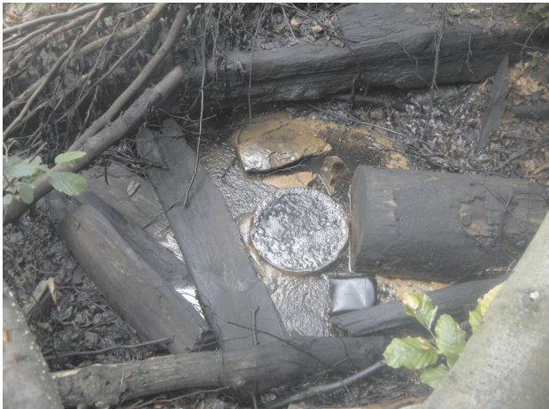
Fig. 3. State of abandoned well before self-acting outflow of oil-polluted water

The ended extraction may create another problem associated with the restoration of formation pressure. The gas getting to the near-surface area could be the reason of uncontrollable discharge of hydrocarbons to the environment. The state of an abandoned well before, during and after self-acting outflow of oil-polluted water is illustrated in Figures 3–5.