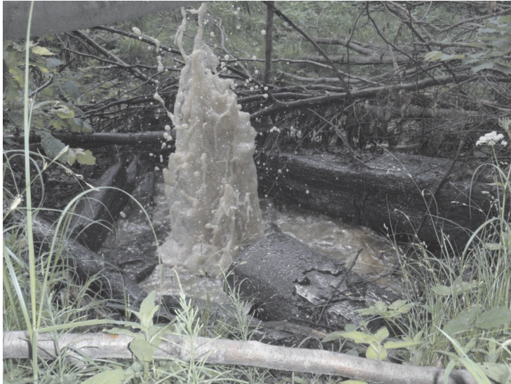
Fig. 4. State of abandoned well during self-acting outflow of oil-polluted water