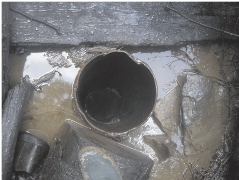
Fig. 5. State of abandoned well after self-acting outflow of oil-polluted water

The blowout of hydrocarbon or brine with hydrocarbons could contaminate the aquatic environment (Fig. 6).