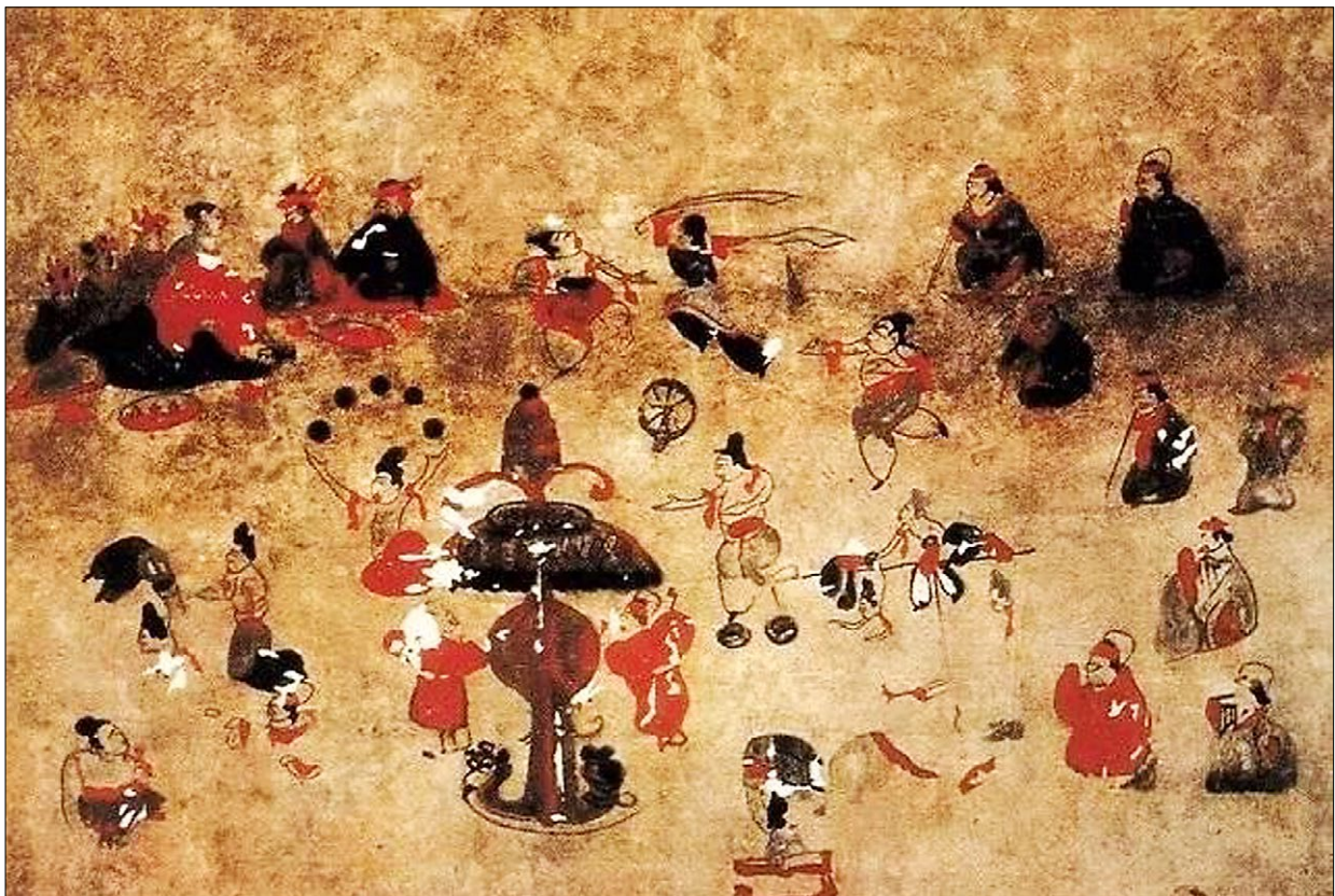
Fig. 3. Dancers and Musicians mural painting in the tomb of Helinge'er Han (the Eastern Han Dynasty, Helinge'er district, Hohhot at Horing'er [Helinge'er 和林格爾] in Hohhot [Huhehaote 呼和浩特].

In Henan murals, the composition has the character of a frieze, but in Luoyang murals, figures are located throughout the entire image field. In the traditional Luoyang storyline Parade Departure , the dynamism is emphasized with the help of composition, outlines of figures and colors. According to tradition, the central place of the composition, around which the plot itself unfolds, is occupied by the cart of an aristocrat surrounded by his retinue, and the movements of both people and horses are conveyed with intentional exaggeration, in order to show mobility. The horses either stand on to the hind legs, or turn their heads as if they want to throw off the rider. Attention to the drawing of details became a hallmark of Luoyang's plot—the axes of the cart, hairstyles, clothes, horse armor. The same attention to detail became a common feature of Han murals. A general characterization of Han period murals would be as follows: