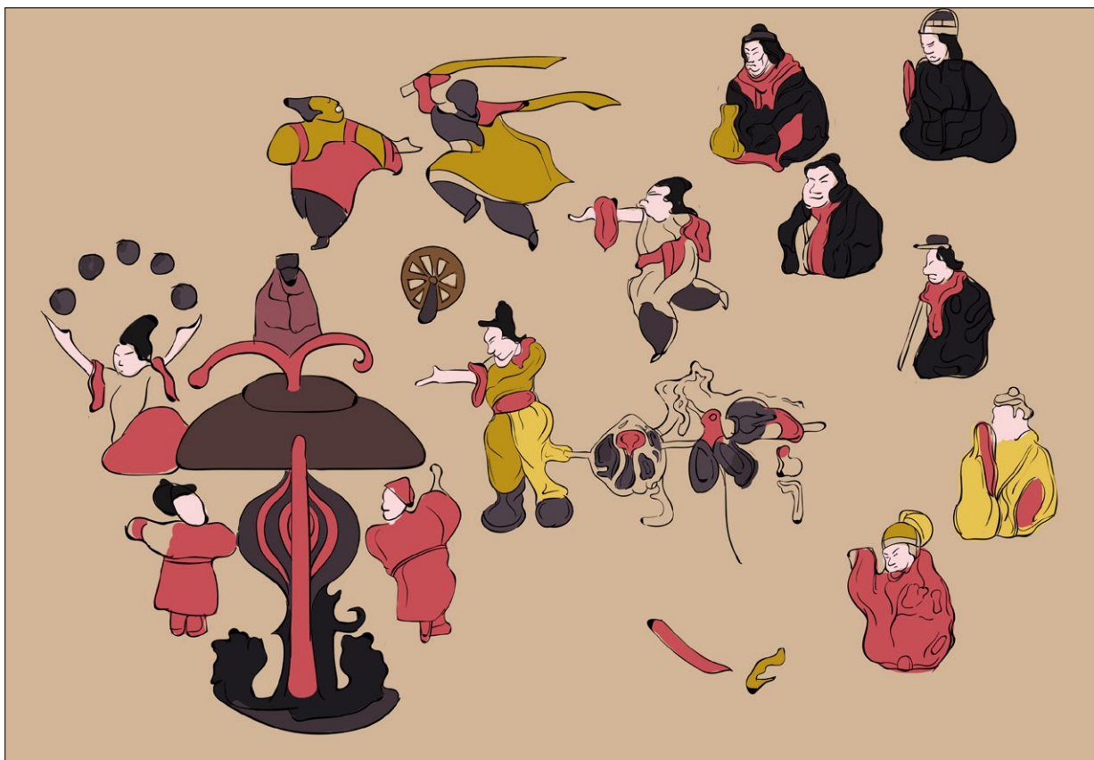
Fig. 4. Graphic reconstruction of a mural painting, 2020; painted by D. Yang.