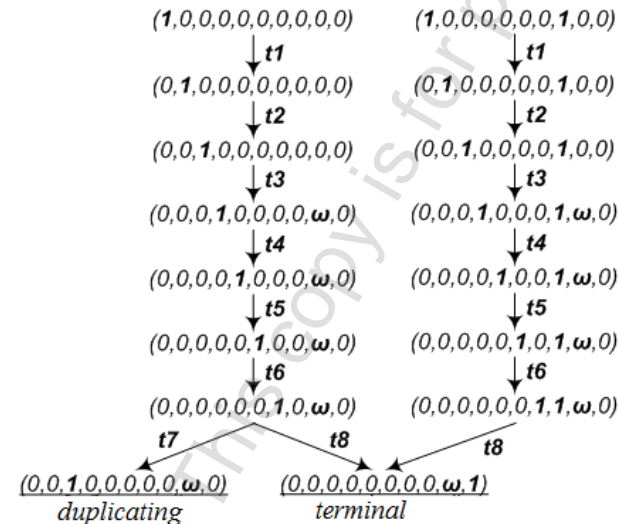
Fig. 2. States reachability graph for the developed model based on Petri nets