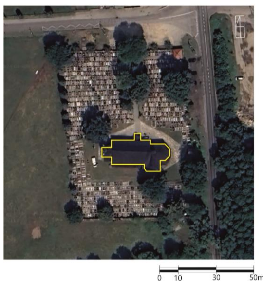
Fig. 2. Location of the church on the premises of a cemetery

From the constructional point of view the nave, presbytery, and the sacristy with the collator loge are built in a log-frame structure, with various beam joinery techniques – dovetail, scarf, and finger. The roof trusses above the nave and the presbytery were built as queen-post, collar-beam, covered with wooden shingles on the roof patches. Typically for Silesian wooden churches the roof above the nave is higher than that above the presbytery. The roof above the presbytery has a hexagonal steeple built-in with a lantern and a tented roof. The roofing of the nave and the presbytery was completed in the form of a flat vaulted ceiling with beams and full boarding. The nave was separated from the presbytery with a rood screen with a flat arch. The roof above the collator loge was originally three-hipped, transverse to the roof above the presbytery. The building was set on a stone and brick underpinning [10, 11].