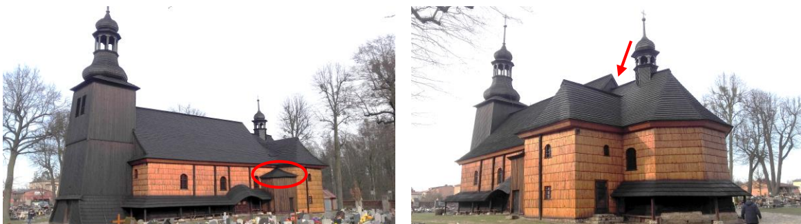
Fig. 6. View of the church after roof renovation: a red oval marks the roof above the lowered stair enclosure, while a red arrow the restored recess of the ridgepole

Due to the historical character of the structure, the final decision was left to the conservator of monuments, who supervised the works. As a result of an analysis of source materials, including archival photographs and drawings a decision was made to lower the original enclosure of the stairs and cover it with a small roof situated below the canopy of the main roofs – which may be seen in Fig. 6. This allowed the renovation of both of the main roofs on the south side to continue as well.