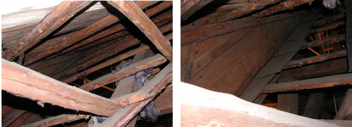
Fig. 5. Fragments of the original roof end above the nave (higher)

After moving on to the southern side, the contractor faced the previously described problem of the spatial interference of the new fragment of the roof above the stairs to the collar loge with the original (recreated) roof arrangement with a sharp change in the level of the ridgepole. Attempts to recreate such an arrangement resulted in the appearance of the aforementioned non-drainage fragment of the roof, which is unacceptable when the roof is shingled. In such a situation the contractor after consulting with the conservator of monuments, asked one of the authors of the article to develop a technical solution.