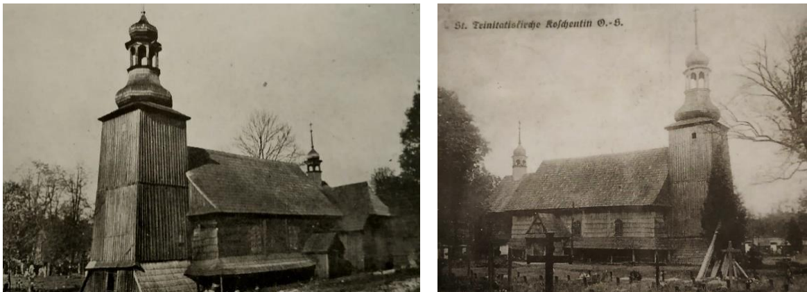
Fig. 3. Archival photographs [5, 12]

Figure 3 shows archival photographs taken from reports [5, 12].