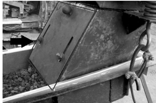
Fig. 4. Installation of the regulating flap on the feeding chute to the feeder

Rys. 4. Zabudowa kłapy regulacyjnej na rynnie podawczej do podajnika