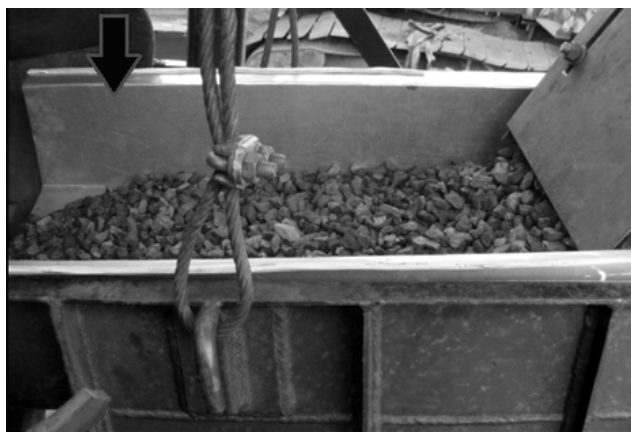
Fig. 5. Feeder covered with the galvanized metal sheet

Rys. 5. Podajnik wyłożony blachą ocynkowaną