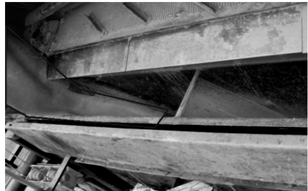
Fig. 2b. Installation of a curtain enabling redirecting part of the separated material from the waste section to the middlings section

Rys. 2a. Zabudowa fartucha umożliwiająca przekierowanie części rozdzielonego materiału ze strefy odpadowej do strefy produktu pośredniego