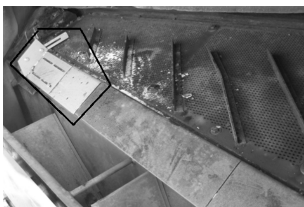
Fig. 6a. Constructional change of discharge damper for receiving waste product

Rys. 5. Podajnik wyłożony blachą ocynkowaną