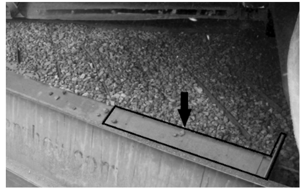
Fig. 1b. Construction of the discharge damper in cleaned coal section

Rys. 1a. Konstrukcja progów przesypowego odbioru produktu węglowego