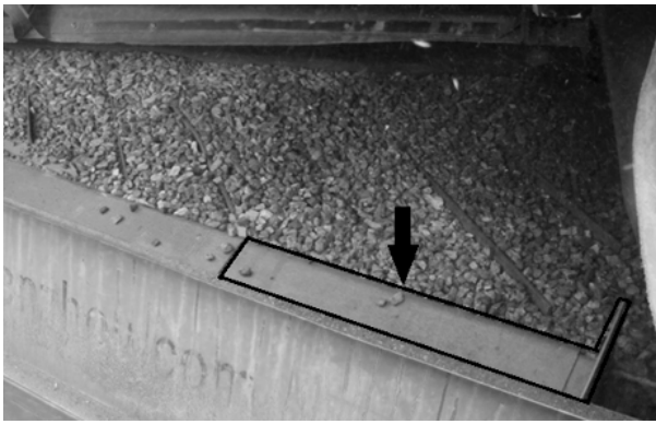
Fig. 1a. Construction of the discharge damper in cleaned coal section

Rys. 1a. Konstrukcja progów przesypowego odbioru produktu węglowego