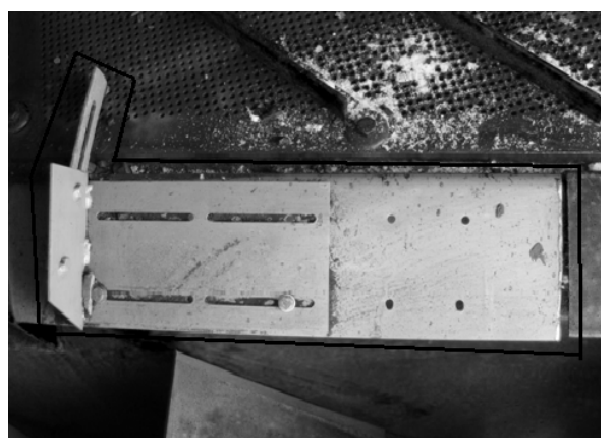
Fig. 6b. Constructional change of discharge damper for receiving waste product

Rys. 6a. Zmiana konstrukcyjna progów przesypowych do odbioru produktu odpadowego