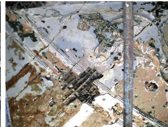
III. 3. The house at 10Bankova Street.Condition of interiors before restoration.

and high-rise tenement buildings. At the beginning of the twentieth century, the medium and multi-storey tenement construction was concentrated mainly in the Upper Town; the pace and scale of construction on Podol were significantly less.