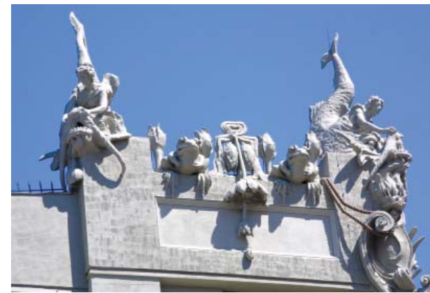
Ill. 8. The house at 10 Bankova Street. a-b. The condition of the sculptures of façade before the restoration. c. The condition of the sculptures of façade after the restoration

The cause of the emergency state of the cement-sand facade decoration of the house at 10 Bankova Street, as well as of the building of the Kachkovskiy clinic, was the corrosion of internal metal reinforcement, which led to the appearance of cracks and loss of fragments of sculptures (Ill. 8).