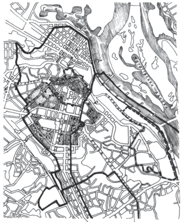
III. 2. The location of the Secession zones on the plan of Kyiv (Scheme of Yu. Ivashko)