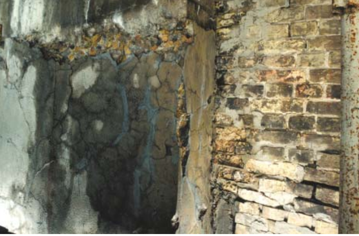
Ill. 7. The house at 10 Bankova Street. The façade before the restoration

The main facade of the building was covered with cracks; it was necessary to replace the waterproofing of the balcony and terrace, a part of the crowned metal elements and to eliminate salt efflorescence. The unsatisfactory technical condition was fixed at the top of the cornice, brackets, decor, decorative ceramic and glass inserts, decorative pedestals of the basement, and sculpture of the main facade. Corrosion of metal fittings inside cement sculptures of sirens and a lion led to their splitting into separate fragments and the loss of some parts with exposure of internal fittings; corrosion of metal fittings caused an emergency condition of the left balcony, floors of the terrace and structures of the passage to the courtyard (Ill. 5).