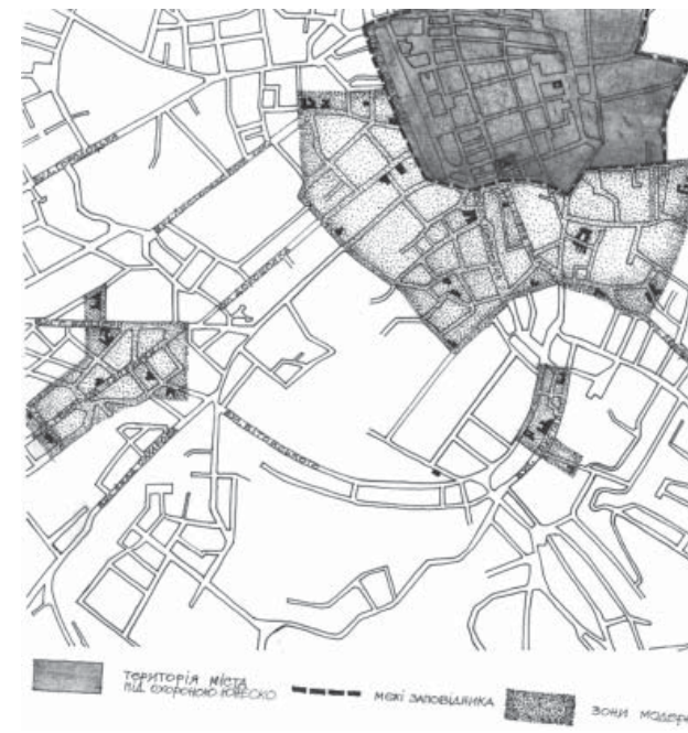
Ill. 1. The location of the Secession zones on the plan of Lviv (Scheme of Yu. Ivashko)

The further development of the engineering network system made it possible to increase the scale of the tenement housing development to the level