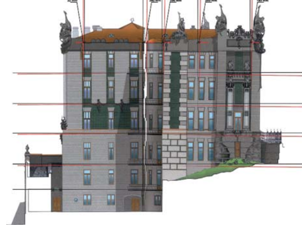
III. 6. Materials of Ukrrestavratsiia corporation, 2001-2003