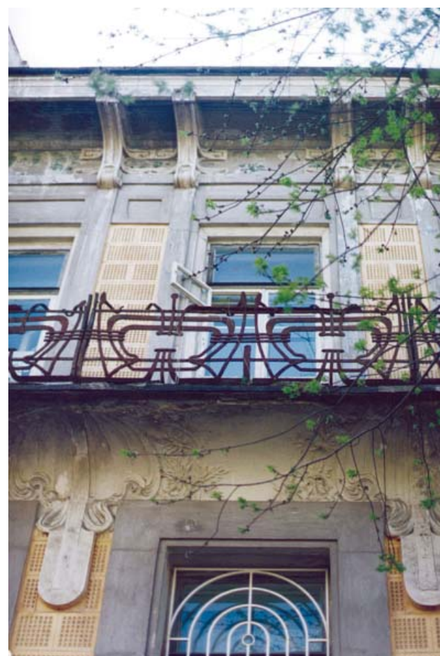
III. 5. The Kachkovskiy clinic. Photo: Yu.Ivashko, 2009. a. The emergency condition – cracks from 32 to 38 cm, b. The scheme of bored piles

in the building of the house of Władysław Horodecki at 10 Bankova Street, the so-called "House with Chimeraes", – a comprehensive restoration of the building including interiors and re-profiling under the residence of the President of Ukraine (III. 3-8). Comparison of the issues and causes of the emergency state of these three houses of the Secession era, shows that at the moment of the surveying, the house at 10 Bankova Street was in the most critical condition because of construction on the complex relief, and because of applying the latest at that time structures. (III. 5).