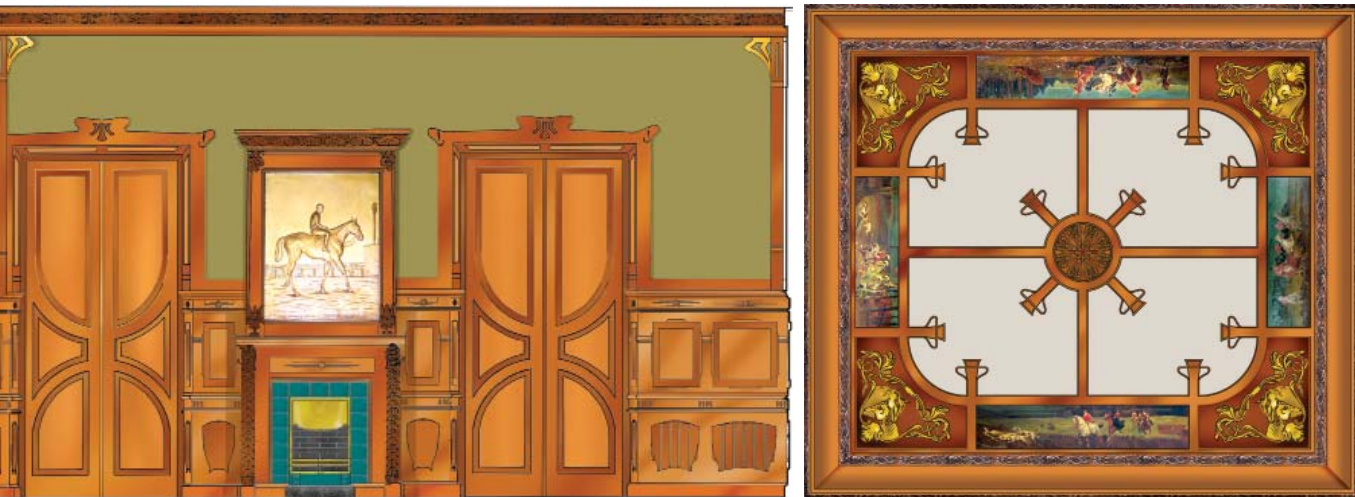
III. 4. The project of the English study in the apartment of L. Rodzianko. (Development of the Ukrproektresvratsia Scientific Institute). a. The balcony before the restoration, b. The gable after the restoration