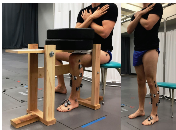
Fig. 1. Two loading conditions: experimental procedures: external loading (left) and bilateral stance (right)

cremental loads were applied to the distal aspect of the thigh up to 50% of BW using a custom-built rig similar to that used in previous studies [1], [9]. The vertical GRF under the instrumented foot was monitored in real time to quantify the amount of external loading. The participants were asked to remain still, refrain from any voluntary elevation of the knee or foot, hold arms across chest, and sit up straight during the external loading. For the second task – quiet bilateral standing – participants maintained an equally balanced bilateral standing position for five seconds with the instrumented foot on a force plate. External loading was performed once, while three trials of bilateral stance were performed and averaged. There was no significant difference between loading magnitude in these two tasks within-subjects ( p = 0.190 ). There was a significant difference in the location of the acting force vector on the foot between conditions with the external loading condition acting an average of 33% of foot length in front of the heel and the bilateral stance load acting an average 45% of foot length in front of the heel ( p < 0.001 ). Though this difference was significant, it was of relatively small magnitude (accounting for only 12% foot length difference) and both acted in the midfoot region.