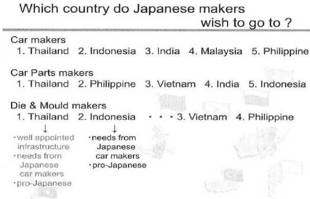
Fig. 1. Countries chosen by Japan, in order of preference, for investment in the automotive industry and related industries [2]

by Indonesia and Vietnam. It can be seen that Japan tends to choose Thailand first when considering investment in the industries mentioned above [2], as shown in Fig. 1.