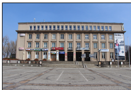
Fig. 2. The south-west front elevation, a photograph from 2018, author: W. Eckert