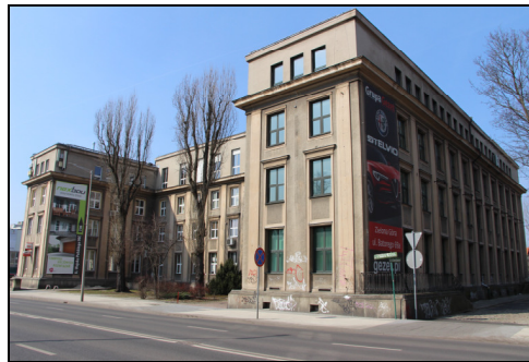
Fig. 4. A south-east view, a photograph from 2018

The north-eastern elevation has thirteen-axes. The outermost axes are blind. There are twenty-one narrow, rectangular window openings on the top floor. On both sides of the façade, there are entrance doors with stairs with a large platform and a steel balustrade.