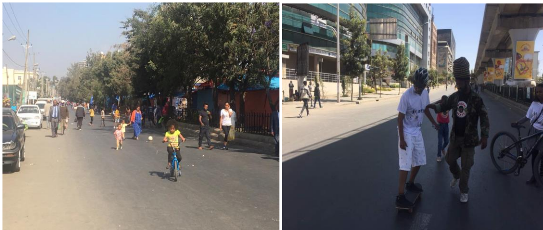
Figure 1: Bicycle and skyboard riders on Car free days