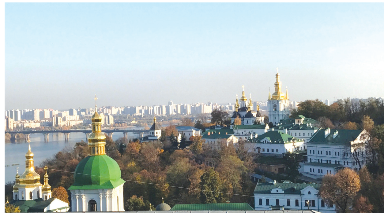
Ill. 1. View to the territory of the Upper Lavra.

There were cells, economic buildings, fences of the monastery in the second belt. The exterior wall of the monastery, besides the utilitarian, defensive role, remained the form of a traditional, canonical image, invariably typical to the monastery.