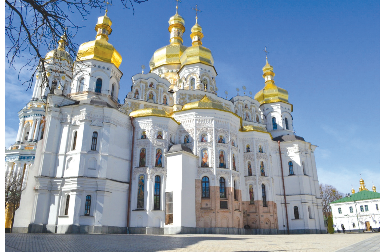
Ill. 2. Dormition Cathedral.

The analysis of the formation of the architectural ensemble makes it possible to follow the ideological foundations of the Ukrainian culture of the very