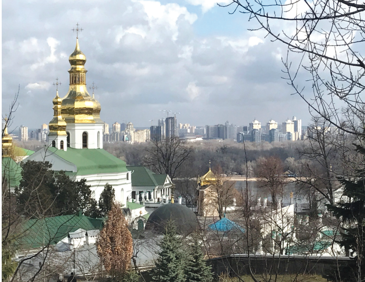
Ill. 4. Church of the Exaltation of the Holy Cross.

the beginning of the 17 th century, a small stone chapel was erected near the entrance to the Near Caves. Fragments of it are revealed by the above-mentioned studies in the structure of a later construction. Then the church was built over the western entrance to the cave, which in its turn was later included to the existing temple.