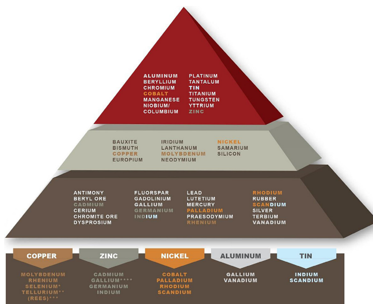
Figure 2. American Resource Risk Pyramid [American Resources Policy Network Report, 2012, p. 15]

As part of further works of the American government towards gaining the independence from other suppliers of critical raw materials, a three-layer American Resource Risk Pyramid was presented (Figure 2) (American Resources Policy Network Report, 2012, s. 15). The tip of the pyramid contains: aluminium, beryllium, chromium, cobalt, manganese, niobium, platinum, tantalum, tin, titanium, tungsten, yttrium and zinc. The middle section of the chart is composed of such raw materials as: bauxite, bismuth, copper, europium, iridium, lanthanum, molybdenum, neodymium, nickel, samarium and silicon. The pyramid base holds: antimony, beryllium, cadmium, cerium, chromite, dysprosium, gadolinium, gallium, germanium, indium, lead, lutetium, mercury, palladium, praeosodymium, rhenium, rhodium, rubber, scandium, silver, terbium and vanadium.