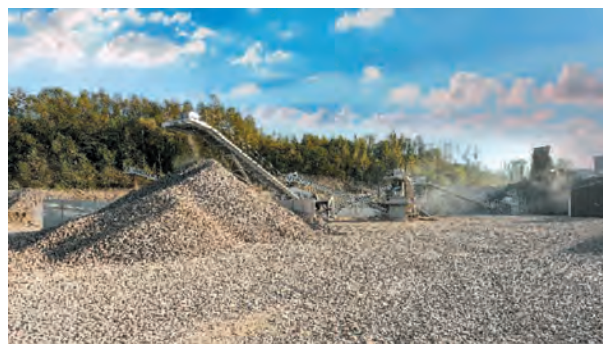
Fig. 14. Mineral aggregates production plant

First, the spoil goes to the first crushing stage (primary crushing) to DCJ jaw crushers, from where it is directed after initial separation to the second crushing stage (secondary crushing), where Metso C-110 jaw crushers and Metso HP-300 cone crushers are installed.