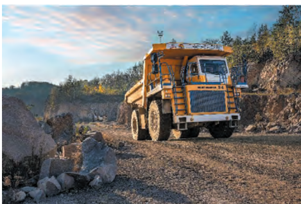
Fig. 13. Białaz 75454 rigid dump truck

Permanent technological roads are located between the exploitation levels.