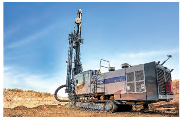
Fig. 6. Furukawa rig in the process of drilling

Blastholes are drilled with Furukawa DCR22 (Fig. 6) and HCR 1450 Japanese rigs.