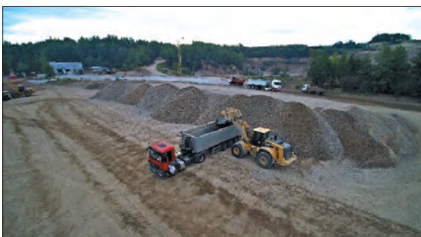
Fig. 16. Loading on a yard with a CAT 972M loader

Finished materials are loaded onto both cars (Fig. 16) and wagons (Fig. 18).