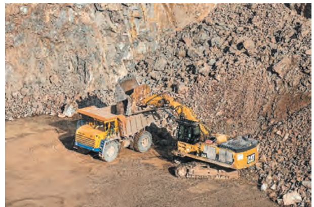
Fig. 10. CAT 385C FS single-bucket hydraulic front shovel

Currently, Caterpillar (CAT) 385C FS (Fig. 10) and Bola LB-600 single-bucket hydraulic front shovels are used for loading (Fig. 11).