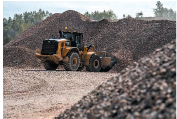
Fig. 17. Loaders during cleaning works

Apart from loading works, loaders are also used for all kinds of auxiliary works, such as: cleaning works (Fig. 17), the shaping of piles at storage yards, ongoing maintenance of permanent and temporary roads.