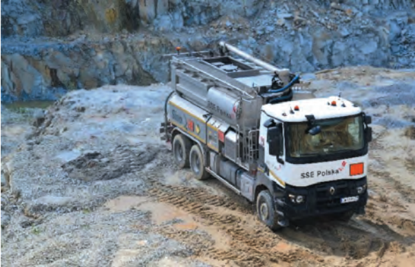
Fig. 7. Blasting rig produced by SSE [6]

blasting works is signalled by appropriate sound signals and it is not until the signals have been transmitted that people can leave safe places – shelters.