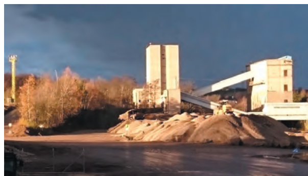
Fig. 15. Processing plant of the “Zalas” Porphyry Mine