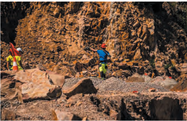
Fig. 8. Blasting works performed by SSE