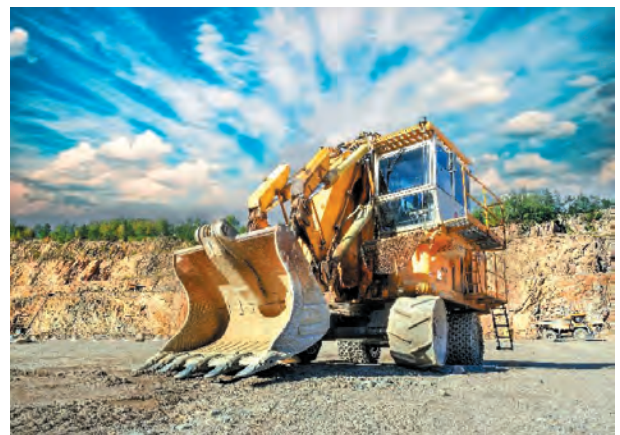
Fig. 11. Bola LB-600 single-bucket hydraulic front shovel