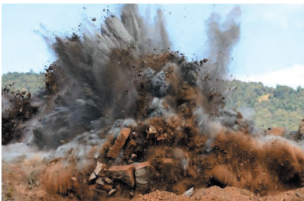
Fig. 5. Blasting works [5]

The rock extracted in volcanic origin rock mines is hard and difficult to mine mechanically. If there are no contraindications, the only solution enabling large-scale extraction and production is drilling and blasting (blasting works) (Fig. 5).