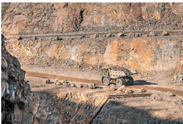
Fig. 12. Białaz 7547 rigid dump truck

Temporary technological roads are made on a stone base. The main vehicles used to transport the excavated material are Białaz rigid dump trucks (Figs. 12, 13).