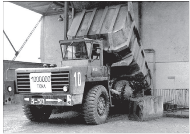
Fig. 3. Millionth ton – 1974

In the initial phase of the mine's operation, production was based on the following machines and devices: DCJ jaw crushers, MAKRUM 40.17 jaw crushers, and SYMONS 5.5 cone crushers.