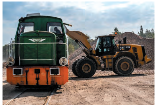
Fig. 18. Loading of railway wagons