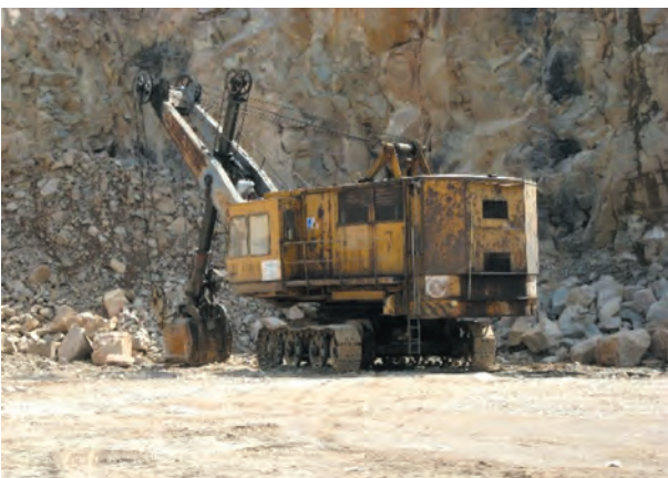
Fig. 9. Skoda E-303 single-bucket rope-electric front shovel

In the initial operation of the “Zalas” Porphyry Mine, Skoda E-303 single-bucket rope-electric front shovels were used to load mined rock (Fig. 9).