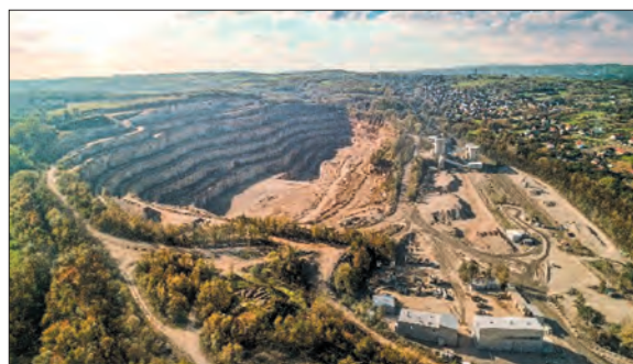
Fig. 1. “Zalas” Porphyry Mine

The “Zalas” Porphyry Mine (Fig. 1) is engaged in the extraction and mechanical processing of porphyry rocks of volcanic origin [1].