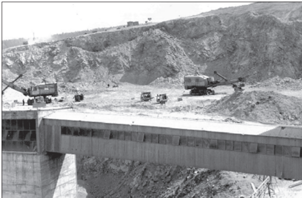
Fig. 2. Beginning of exploitation

In 1972, the finishing works of the new plant were intensified (Fig. 2). At the same time, the staff were trained and the start-up of a new processing plant began.