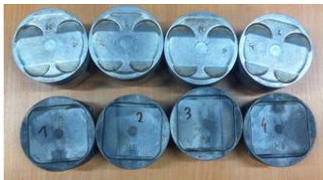
Fig. 1. Image of researched engine pistons

To determine the chemical composition of the pistons Olympus DP 2000CC spectroscope- equipment of Palfinger Poland sp. z o.o. was used. Measurements were carried out six times for each piston. An analysis showed the chemical composition of the alloy according to PN-EN 1706:2020-10 norm - English version, (PN-EN 1706:2011 Polish version) as EN AC- \text{AlSi12CuNiMg} alloy. This alloy also denoted as EN AC-48000, is known to have been widely applied in piston production since the 30s of the 20 th century [6, 13, 26]. The chemical composition presented in Table 1 is in compliance with the PN-EN 1706: 2011 standard.