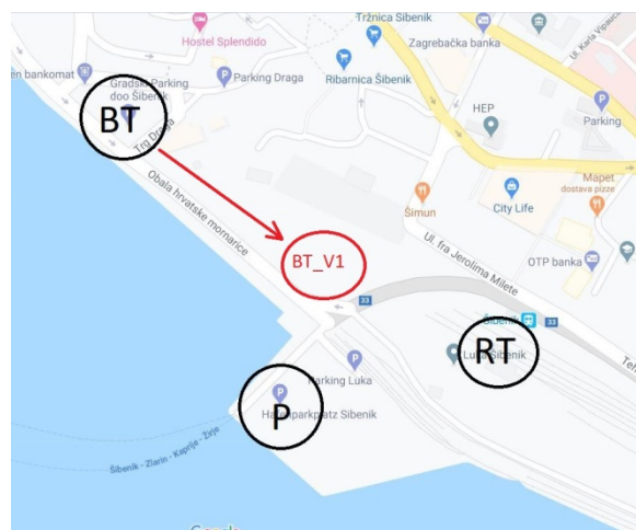
Fig. 2. Variant 1 of a transport solution of the integration point in Šibenik

The first variant entails relocating the bus terminal to a location next to the port as shown in Fig. 2. The railway terminal would be located at a higher sea level. The port would have an independent passenger maritime terminal that would be a ticket vendor and distributor of accompanying services. The bus terminal would be at a lower sea level and would also have the same kind of facilities. The railway terminal on the upper level would be connected to the lower level via a staircase or escalator placed right next to the bus terminal. The passenger terminal would be located at the same place it is today. The lower level would have a taxi rank, rent-a-car and cycling facilities, and park & ride and kiss & ride systems.