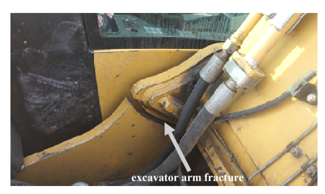
Fig. 1. Example of a mining excavator arm fracture

The crack was identified by the excavator operator during the extraction of the deposit. The immediate actions taken included reporting the problem to the manager and other excavator operators, securing the excavator against restarting and reporting the defect to an external repair company.