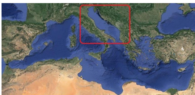
Fig. 1. Position of Adriatic Sea

Sustainable speed can be determined by limiting values of operability criteria such as propeller emergence, deck wetness and absolute bow accelerations. Seafarers' understanding of the operability criteria is important for ship safety. Combination of mentioned knowledge and existing support on ships, such as Integrated Navigation System (INS), leads to safer navigation in heavy seas.