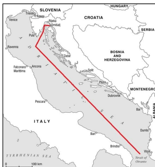
Fig. 2. Product tanker route from Otranto to island Krk (Omišalj oil terminal)