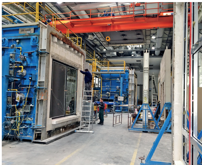
Fig. 4. Large furnaces hall in the Fire Testing Laboratory of Building Research Institute, Pionki

Accredited fire testing laboratories play a major part in the shaping of the development of civil engineering [85], Fig. 4. The most obvious role of the laboratory is in the initial product testing – a complex evaluation of whether the products or materials meet their requirements stated in prescriptive acts of law. This is an essential part of the certification of products, which in the end allows them to be used in construction. Such testing also allows the manufacturers to verify their solutions