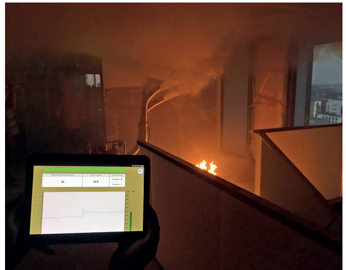
Fig. 5. Dynamic measurements of pressure differential system, combined with a hot smoke commissioning test in a high-rise building – a site acceptance testing method developed in Fire Testing Laboratory

against large-scale fire, which is a vital part of product development. As mentioned in chapter 4, in a highly rigid legislative framework, evolution of solutions and materials to meet higher rankings and requirements is the most basic form of progress in the construction industry. New advancements in materials, products and techniques heavily influence how buildings are designed and built. Besides the basic function as the evaluator, fire testing laboratories take part in market surveillance. In this process, products (e.g. fire doors, insulation materials) are purchased on the market, and then their characteristics are estimated. This process ensures that the products available on the market are the same, as they were tested during their approval and certification phase. A similar process is sometimes observed in the construction of critical infrastructure. Randomly chosen samples of products may be tested in a fire testing laboratory, before the whole batch of products is installed in the building.