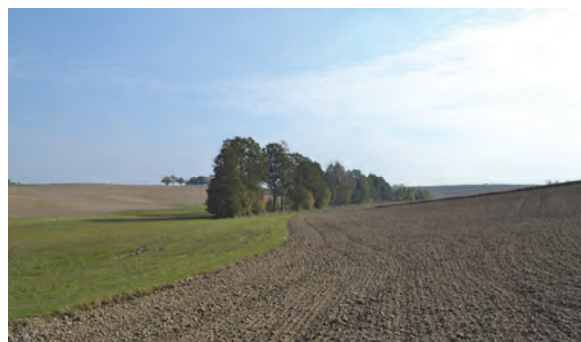
Phot. 1. Adjacent surroundings of planned reservoir No. 1; (photo T. Zubala)

The differences in elevation between the watershed and the valley bottoms reach 20 m. The width of the bottoms of the main valleys varies within the range of 20–120 m. The lengths of the catchments